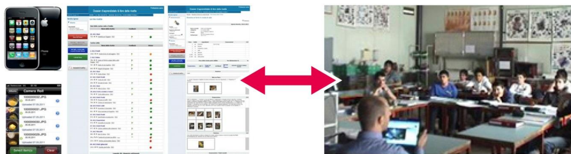
Figure 3. The mobile device and application, the online environment and the classroom setting.