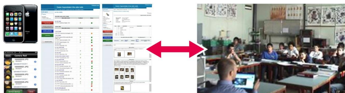
Figure 3. The mobile device and application, the online environment and the classroom setting.