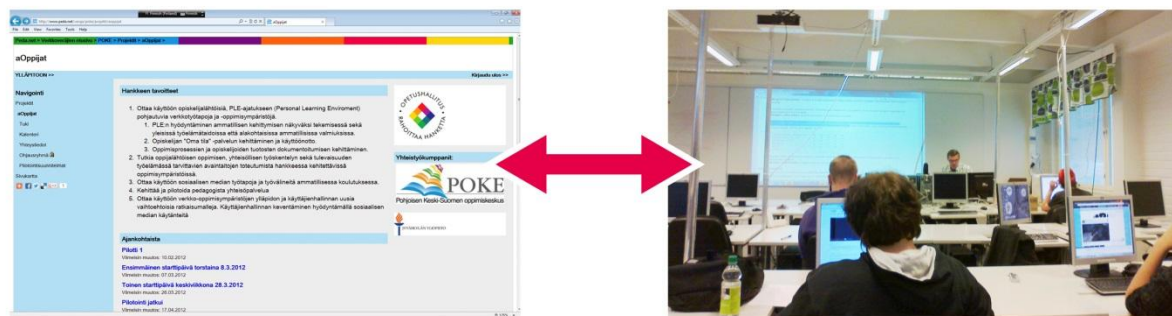
Figure 1. The technological environment and technology-enhanced classroom context.

five phases in which the blog tool was actively used for reporting and reflecting: (a) choosing a Linux distribution according to each learner's own interests and skills; (b) installing the selected Linux distribution on the computer and comparing different students' experiences on the installation process with the installation of Open Suse Linux ('Was it easier/more difficult?', 'What were the differences?'); (c) becoming familiar with the use of their Linux distribution in the workstation environment; (d) becoming familiar with other students' installations; (e) making a questionnaire (for other students) on the issues concerning installation and writing a summary of the questionnaire responses. The task was carried out over the course of five days (altogether, 10 hours of face-to-face interaction). The aim of the learning task was to become familiar with the issues concerning installation and the actual operation of different Linux distributions.