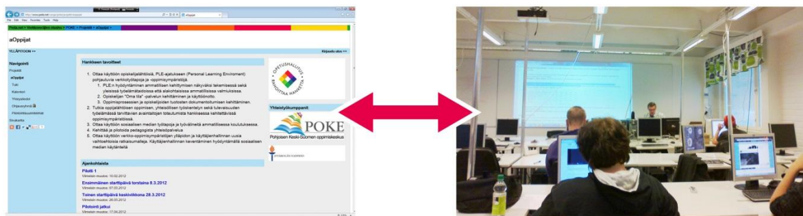
Figure 1. The technological environment and technology-enhanced classroom context.

five phases in which the blog tool was actively used for reporting and reflecting: (a) choosing a Linux distribution according to each learner's own interests and skills; (b) installing the selected Linux distribution on the computer and comparing different students' experiences on the installation process with the installation of Open Suse Linux ('Was it easier/more difficult?', 'What were the differences?'); (c) becoming familiar with the use of their Linux distribution in the workstation environment; (d) becoming familiar with other students' installations; (e) making a questionnaire (for other students) on the issues concerning installation and writing a summary of the questionnaire responses. The task was carried out over the course of five days (altogether, 10 hours of face-to-face interaction). The aim of the learning task was to become familiar with the issues concerning installation and the actual operation of different Linux distributions.