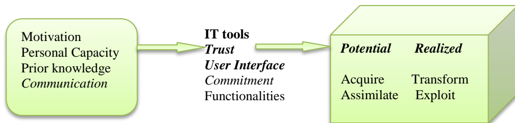
Figure 1 A conceptual model

We refine the concept and extend the absorptive capacity model of Zahra and George (2002) and summarize our analysis into a conceptual model, see Figure 1.