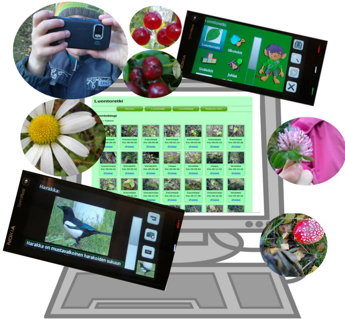
Figure 1. The Nature Tour Mobile System (a mobile application and a website).