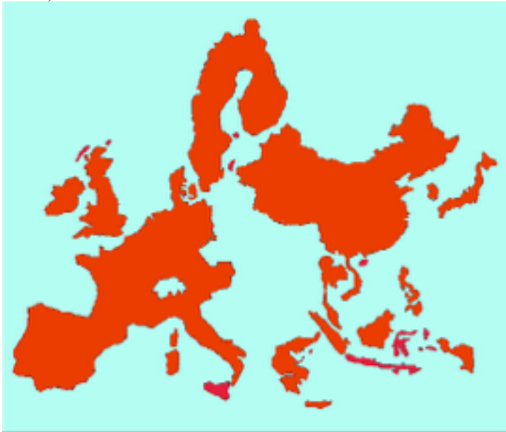
Map 1. ASEM 1996

During its brief history ASEM has rapidly evolved from a mid-size international organization in 1996 to a fairly large organization in 2014. In the inaugural meeting in 1996 there were 25 state members, clearly limited to member states of the European Union and the ASEAN+3 formation. The categories of Asia and Europe were clear and undisputable, and it seemed that the economically and politically strong two extremes of the Eurasian landmass were monopolizing the usages of Asia and Europe (Korhonen, 2007).