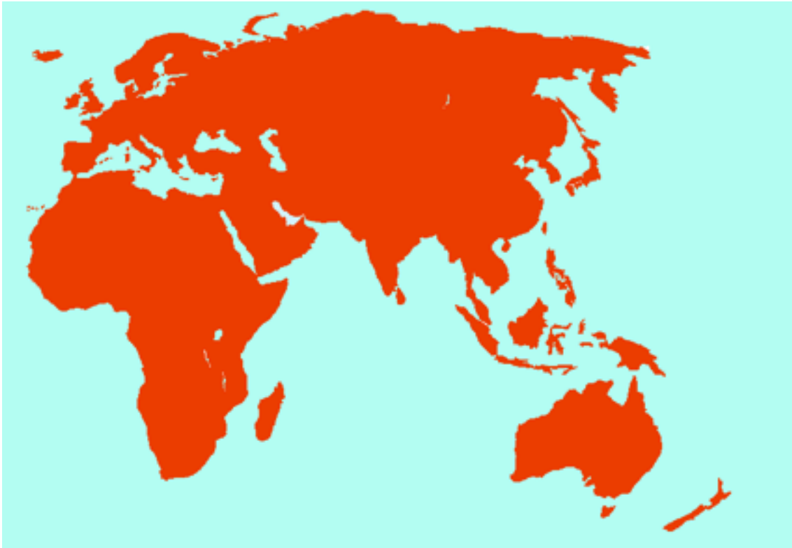
Map 6. ASEM 2035? Modification from – "LocationEurasiaWithoutIslands". Licensed under Public domain via Wikimedia Commons - http://commons.wikimedia.org/wiki/File:LocationEurasiaWithoutIslands.PNG#mediaviewer/File:LocationEurasiaWithoutIslands.PNG