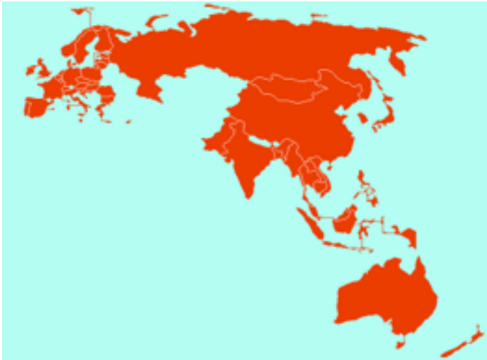
Map 2. ASEM 2014. Modification from Datastat - Modification from Wikipedia. Licensed under Public domain via Wikimedia Commons - http://commons.wikimedia.org/wiki/File/ASEM.PNG#mediaviewer/File/ASEM.PNG

At the same time the binary categories of Asia and Europe have become slightly blurred, because geographically peripheral and boundary states have been added. During the 8th ASEM Summit held in 2010 in Brussels Australia, New Zealand and Russia were accepted as members. They were problematic cases in terms of definitional categories, as in Asia there has been a long debate whether Australia and New Zealand could be defined as Asian states, dating to Australian Foreign Minister Gareth Evans' redescription of the "East Asian Hemisphere" in the 1990's (Evans, 1995). In the case of Russia the categorical problem was that it is situated both in Europe and Asia, so that it was unclear whether it joins as a "European" or as an "Asian" state, while the EU at that time still reserved the category of Europe only for EU member states. These definitional hurdles were overcome by adding a new category, namely the "Third group" (Gulyaeva, 2012), called also the "Pacific group" (Yeo, 2013). During the 9th ASEM Summit in 2012 in Vientiane Norway and Switzerland were added, thus again diluting the narrow definition of "Europe" to mean only the EU within the ASEM categories.