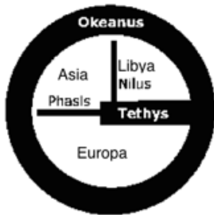
Map 3. The ancient continents and their boundaries

these waterways. Tethys ran from west to east, and the Nile from south to north. The Aeschulian solution was to concentrate on the west-east direction, and elevate Phasis to a rank similar to the Nile, as a wide stream dividing two continents from each other.