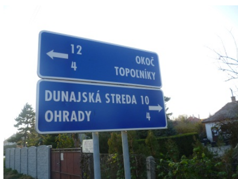
Figure 3. A road sign in Slovak only in Vásárút

An important subcategory consists of a range of warning signs and notices. Local Hungarians often commented that such signs should be in Slovak, since they are official, however, in fact, according to the law (see Third Report... 2012: 54-55), signs on the threat to life and health should be bilingual in minority settlements.