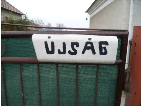
Figure 10. "Newspapers" in Hungarian in Vásárút