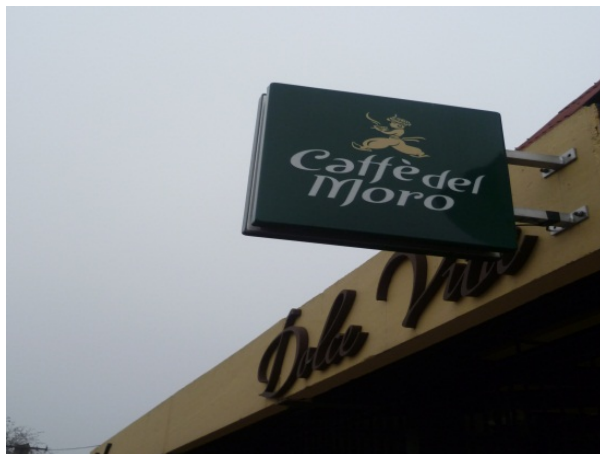
Figure 6. Dolce Vita and Caffè del Moro in Vásárút

The use of Italian names takes place in a local café (figure 6). The owner explained that the Caffè del Moro sign had come together with all kinds of other supplementary products, such as sugar and glasses. Sugar packages had texts in Italian and German. The café in general had Slovak-Hungarian bilingual signs. The use of English and Italian names or internationalisms for shops and cafés in the Hungarian majority region of Slovakia is explained by Lanstyák and Szabó Mihály (2009: 67) as a strategy to avoid translating the names to either Slovak or Hungarian. In small rural villages such as Vásárút, customers are primarily Hungarians, so using a Slovak name would be a marked choice, and a monolingual Hungarian name could likewise be considered as taking an overtly pro-Hungarian standpoint which is often deemed as provocative and avoided by the entrepreneurs. Thus, the use of English or Italian is a way to escape this problem. In Reca the names of companies are mostly in Slovak. That is, Slovak names are the unmarked choice. Here the internationalisms can be seen as barely attracting more attention by displaying a West-European orientation (as one informant in Reca put it “there was a time when western products were all we longed for”).