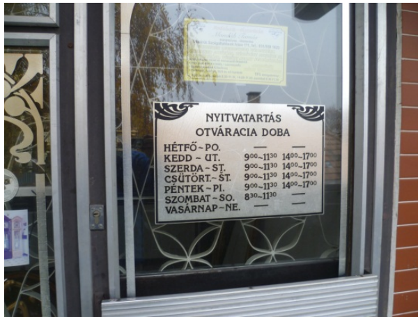
Figure 5. Hungarian as the preferred code in Vásárút