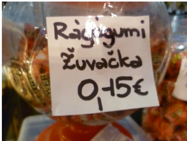
Figure 7. ‘Chewing gum’ in Vásárút with Hungarian above and Slovak below

párki for sausage (SH: virslí ) and zsúvi for chewing gum (SH: rágó ) are widely used in the villages. They were first introduced in Slovak in the villages (Lanstyák 2000: 155) and the way that they have become a permanent part of the local variety of Hungarian is further explained by the fact that they are still mostly sold in packages that do not contain Hungarian inscriptions. However in the local café, žuvačka ( zsúvi ‘chewing gum’) was translated to rágógumi which is very rare. It is noteworthy that in figure 7, Hungarian is above the Slovak, which was the only case in the café. In brief, the display of the Standard Hungarian rágógumi alongside the emblematic žuvačka is definitely a marked event.