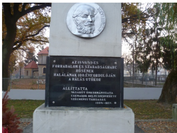
Figure 9. A statue of Lajos Kossuth in Vásárút (Hungarian only)

Among civic organizations, the cultural association for Hungarians in Slovakia, Csemadok, is active in both villages and arranges symbolically significant events and displays signs in which Hungarian is often used. It has erected a kopjafa , a wooden monument with the word rendületlenül carved on it in Reca. Rendületlenül ('steadfastly') is the emblematic word of the second Hungarian national anthem ( Szózat ). In Vásárút, Csemadok, together with other Hungarian organizations and the municipality, has erected a statue of Lajos Kossuth, a mid-19 th century freedom fighter and the father of Hungarian democracy (figure 9). This monolingual statue was presented as a major achievement by the community leaders, since it was “done in the worst Mečiar years” (1994).