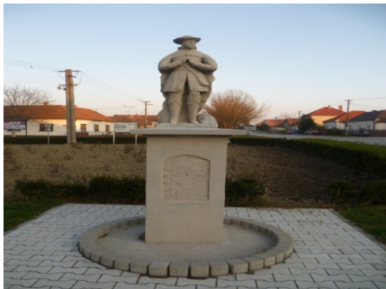
Figure 8. Saint Wendelin in Vásárút, with no text

The church is an important autonomous institution where a non-vernacular version of the Hungarian language is used in the villages. However, the churches do not have many signs in public places, rather signs are confined to inner spaces. The public religious signs typically consist of statues of the saints. The texts are in Hungarian or Latin. In Vásárút, a statue with the year 1756 has a text in Latin, but a woodcarving next to the Reca Catholic Church from 2006 has the text Stephanus Rex . According to the local informants, the name of the first Hungarian King (H: I. Szent István , 1000-1038) was carved in Latin as a precaution, to avoid conflict. As shown in Figure 8, one finds a statue of Saint Wendelin with no text in Vásárút. According to several informants it was left blank intentionally, since “this madness [of compulsory Slovak inscriptions] will not last forever, and we have eternity to wait”. The churches thus represent the only public sites which present a Hungarian LL. In church exteriors, Latin is used for avoiding trouble or inscriptions are “postponed”.