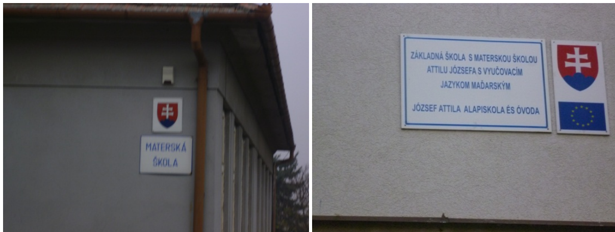
Figure 4. Slovak Kindergarten in Reca (left) and a Hungarian school in Vásárút (right)

What are the monolingual signs placed by the municipality then? In Reca these include texts on the trash cans for instance, and a sign on the Slovak kindergarten (Figure 4). It is noticeable that the signs for Hungarian schools or kindergartens always include a Slovak explanation that the school uses Hungarian as the medium of instruction. That is, they present the marked case against the unmarked ones of monolingually labeled Slovak institutions.