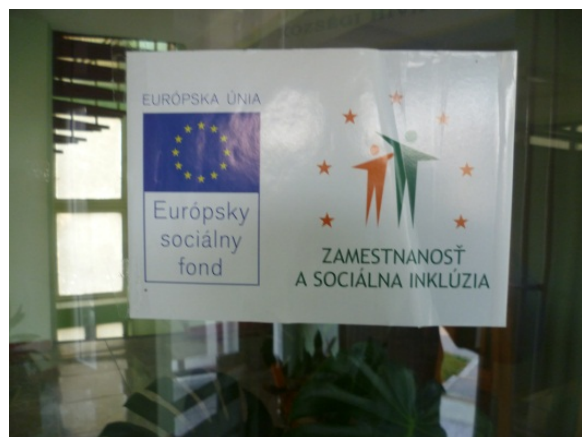
Figure 2. EU sign in Vásárút (Slovak only)