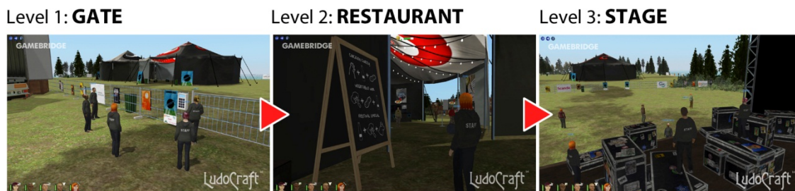
Figure 1. Screenshots of the 3D game environment.

VoIP speech system. The design of the game used in this study has been grounded on the continuous iterative collaboration of teachers and work life instructors (N = 8) who defined inter-professional collaboration as one of the main challenges that students meet in their further work life and which is currently weakly supported in vocational schools. Therefore, the constitutive idea of the scripted game is to offer added value to vocational education by narrowing the gap between current vocational education practices and the demands of the employment field. In more detail, currently, work tasks are becoming more and more complicated, and work is typically based on inter-professional expertise, as well as the shared construction of new knowledge (Paloniemi & Collin, 2012). At the same time, a recent Eurydice report from the European Commission (2012) highlights that not all competencies are treated equally at school; while basic skills (e.g., literacy, science) are well-rehearsed, the teaching and learning of transversal skills is lagging behind. Thus, grounded on the Finnish national core curricula of vocational education the aim of the game is to enhance inter-professional knowledge construction in the area of human sustainability (see, National qualification requirements for vocational education and training, 2010).