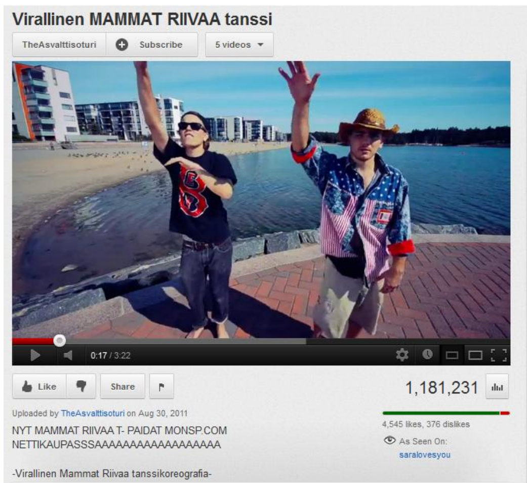
FIGURE 3: A screenshot of the official Mammat riivaa dance video (ENDNOTE 7)

In addition to the re-localization of the song, the dance performance in the original video has been transformed in the Finnish video. While Danza Kuduro features half-naked women dancing around the male singers, in Mammat Riivaa it is the two male rappers who do the dancing. Their choreography also differs a great deal