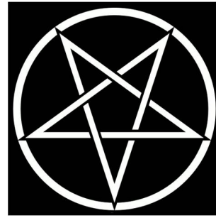
Fig. 2. A pentagram.

Note to the copy-editor: please place Figures 1 & 2 next to each other.