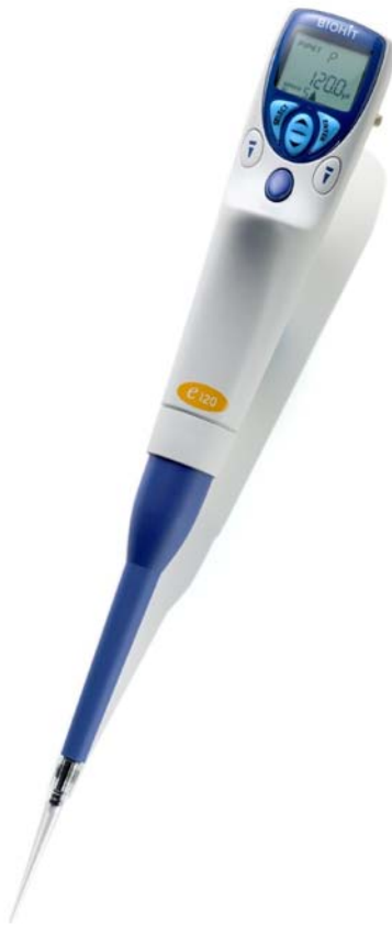
Exhibit 2. Electronic pipette eLine by Biohit.

The operators in the liquid handling market include several larger global manufacturers and marketers, plus numerous smaller players. Increases in supply together with cheap production have intensified price competition. However, strict quality and safety standards have made market entry difficult for copycat products, most of which are manufactured in Asia. Biohit has invested substantially in quality in all its production facilities and operations. The company is still the global market leader in electronic pipettes and OEM (Original Equipment Manufacturer) liquid handling products, and is a pioneer in terms of promoting high quality and the safe use of its products. Rapid delivery of disposable products to customers has become a major competitive factor, and thus Biohit has put a heavy emphasis on improving the efficiency of its distribution processes throughout the Group.