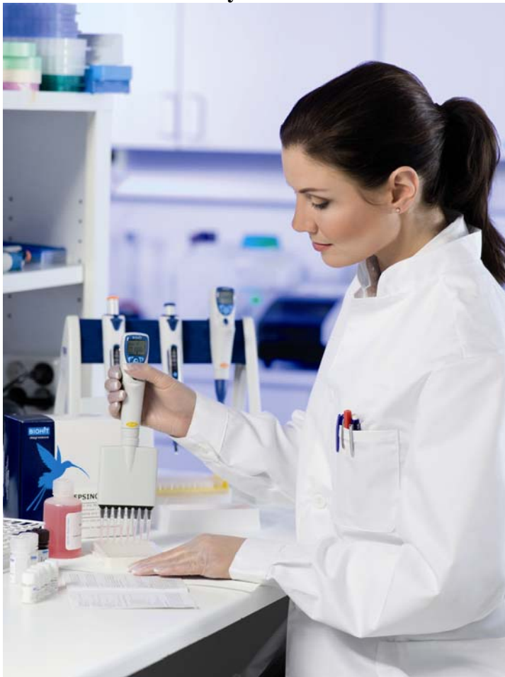
Exhibit 3. Service lab by Biohit.

As the level of precision and safety demanded in liquid handling rises, and as quality assurance regulations become stricter, equipment performance and measurement traceability have become a challenge for many laboratories. Pipette accuracy must be ensured via calibration and performance testing that complies with quality standards. The provision of accredited calibration services has given Biohit a competitive edge.