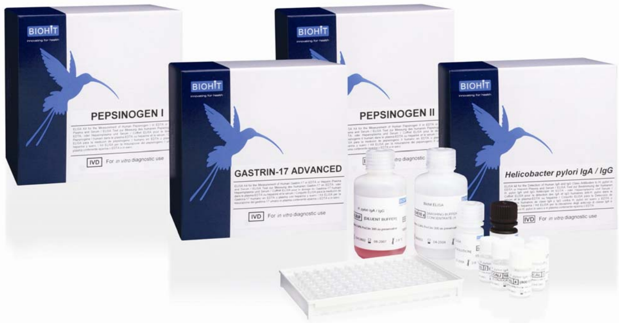
Exhibit 4. Gastro Panel Diagnostics by Biohit.

In addition to large global companies, the companies in the diagnostics market include smaller companies such as Biohit, which specialize in particular diagnostic fields. Harnessing the huge market potential of Biohit's diagnostic products requires proactive sales and marketing, and also cooperation with strong partners who specialize in diagnostics.