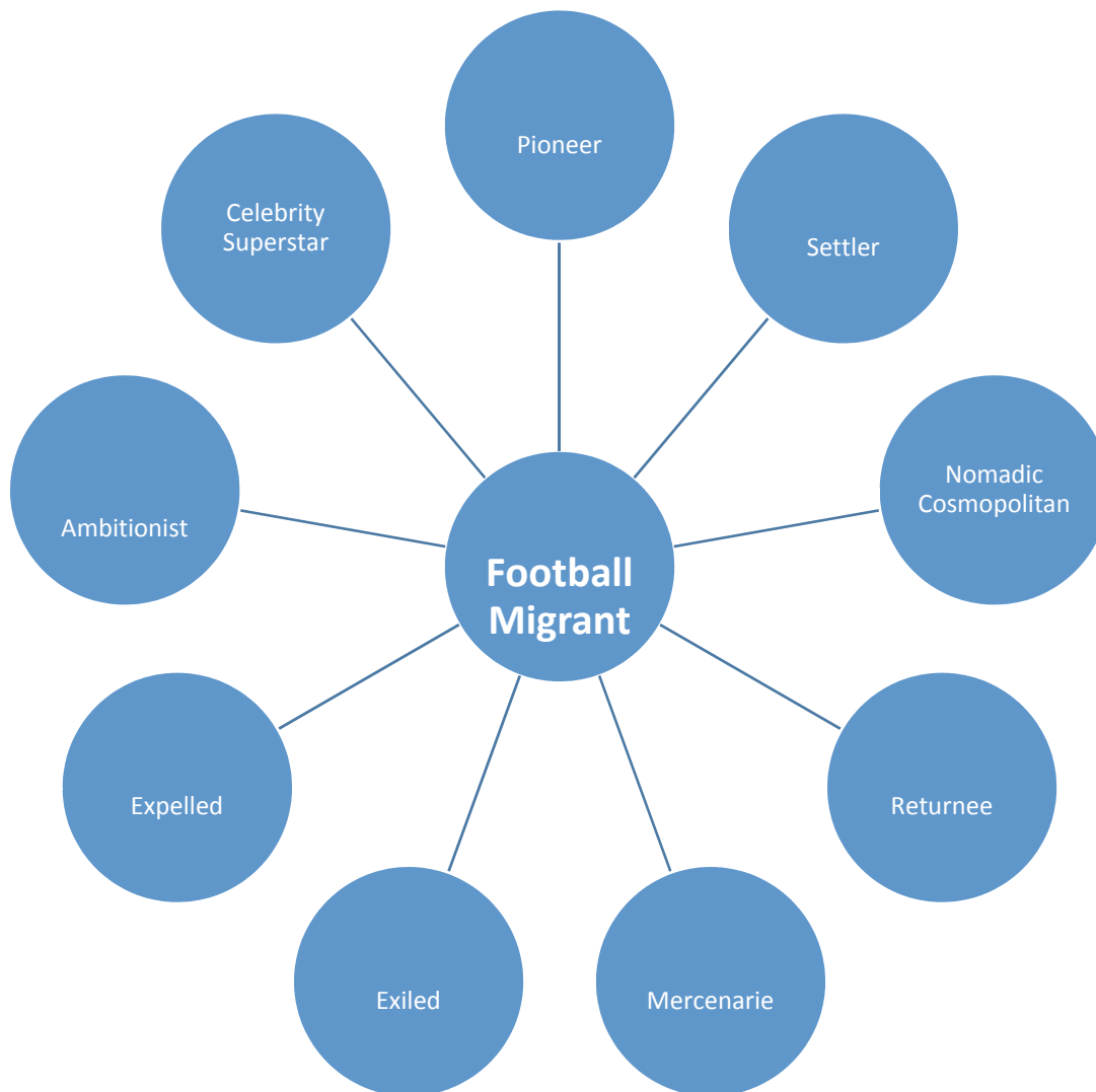
Figure 2 Typology of football labor migration.

Sources: Maguire (1999) and Magee & Sugden (2002)