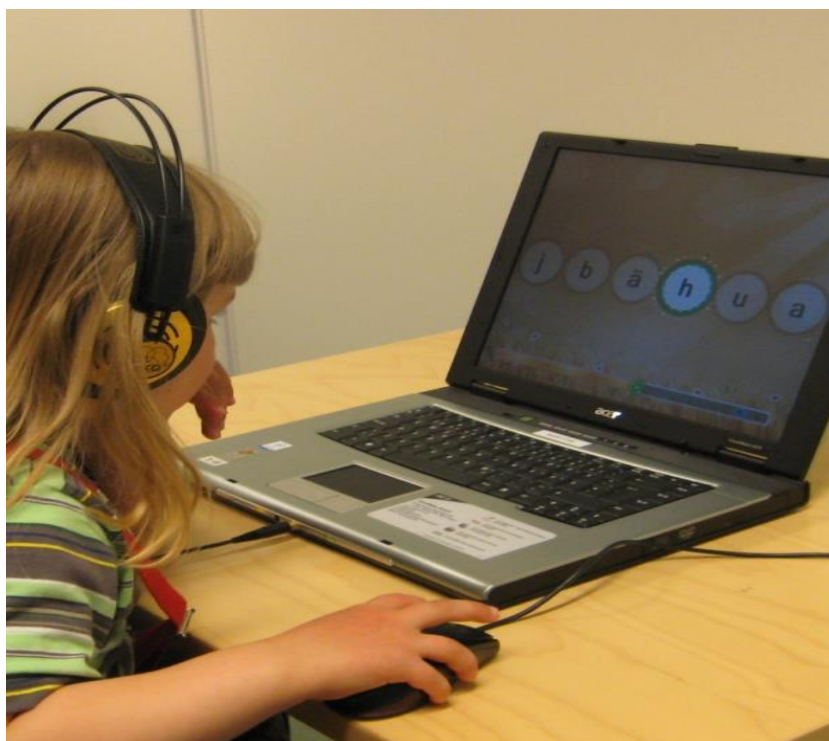
Figure 1. A child, wearing headphones, plays GraphoGame on a laptop computer, one of many devices that can host GraphoGame.

On the surface, the game appears to be like any other digital game, or rather educational game, aimed at children in the early stages of their formal education. Figure 1 shows a child playing GraphoGame. The outward appearance of the game is simple, with only a few visual elements displayed at a time, accompanied by short segments of speech. The main tasks include both time-restricted and untimed multiple-choice trials in which the player is to pair an audio segment (phoneme, syllable, word) with the appropriate visual representation (a letter or longer text segment). Mixed in with these reactive types of trials are the more active tasks of constructing written words from smaller components to match the spoken target words. The game provides immediate feedback on the player's accuracy. In the case of an inaccurate response, the game immediately guides the player to make the correct mapping, thereby teaching the player. After a short sequence of item mappings, the player is provided performance rewards in the form of game tokens, virtual stickers, and the like. The turnaround in a game is very short, providing rewards after approximately one minute of training time. Some elements in the game can be manipulated by the player, thus giving the player a sense of choice, for example, choice involving the outward appearance of the game characters, the selection of tasks to play next, or the direction the game character moves on a map. One feature