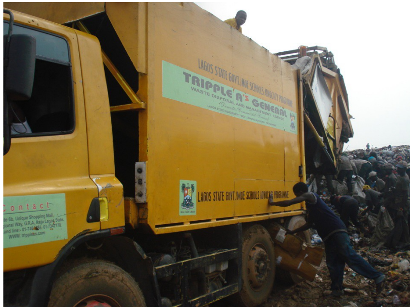
Figure 1.4: Scavengers busy at the dumpsite at Olusosun, Lagos State, Nigeria.