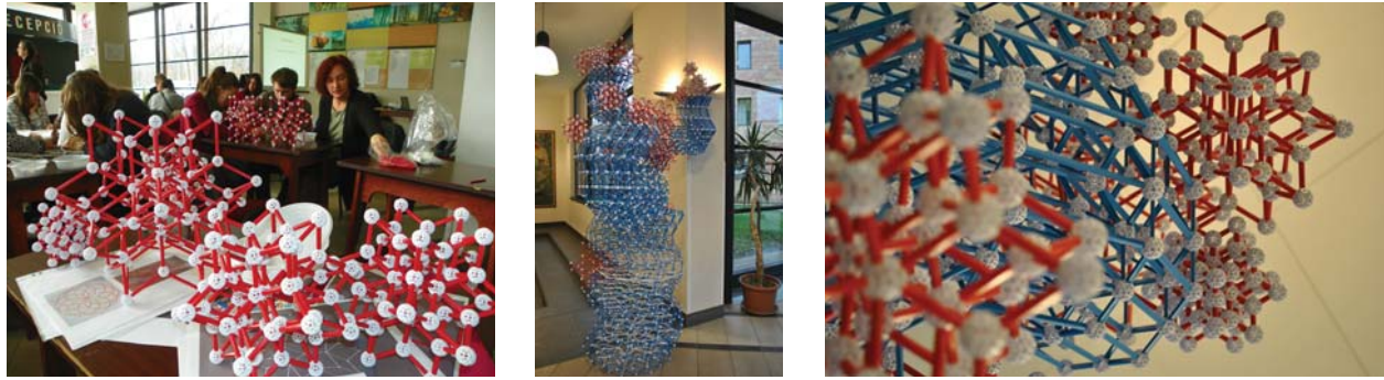
Figure 1: Zometool Quasicrystal workshop.