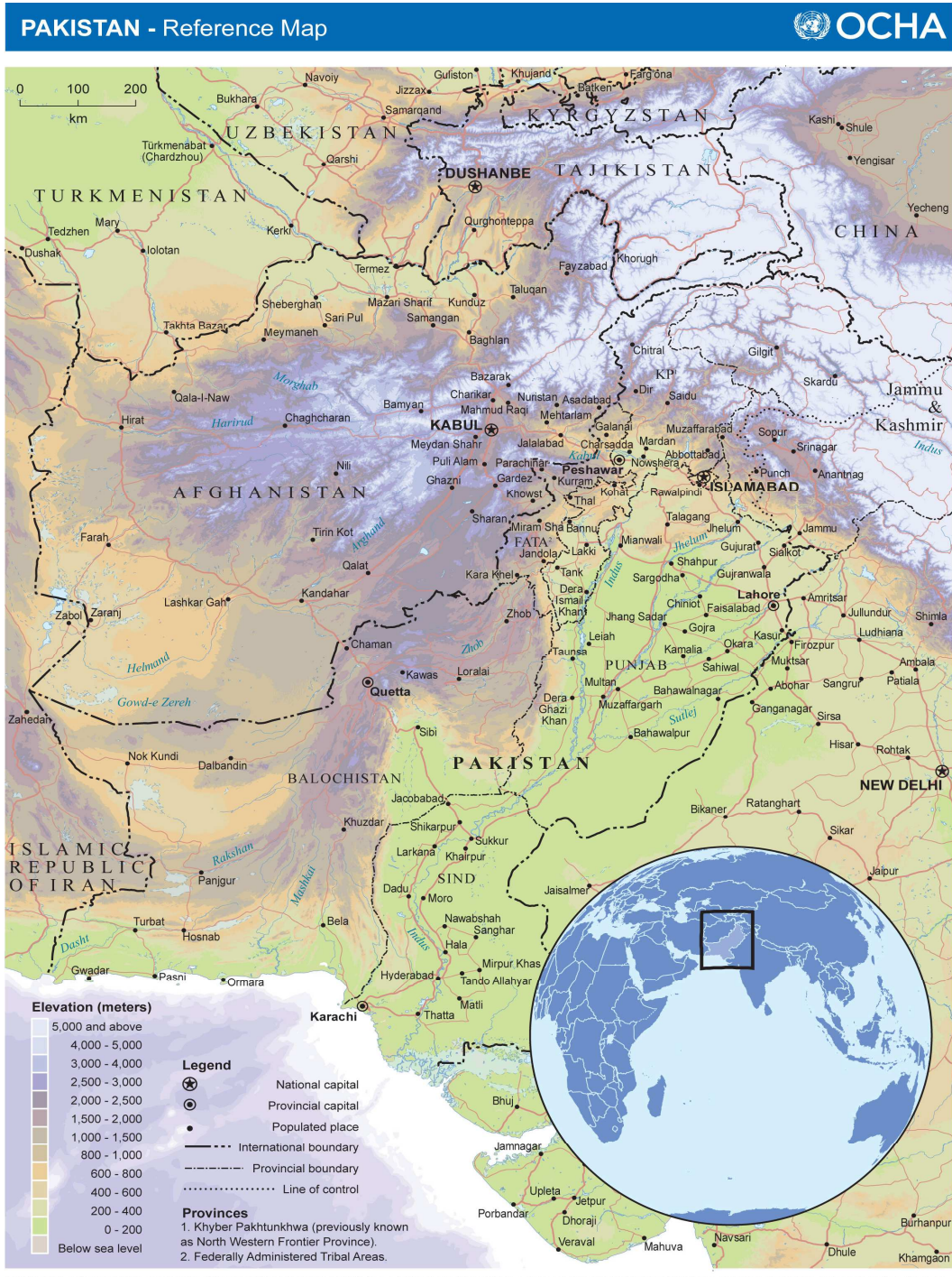
FIGURE 3 Map of Pakistan.