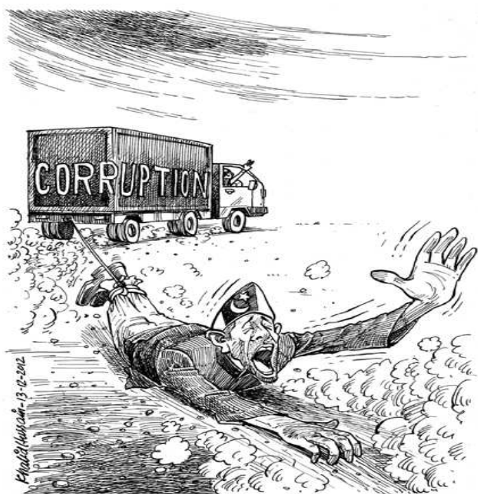
FIGURE 2 Cartoon on corruption in Daily Times (Hussain, 14 Dec 2012)

This alarming corruption trend has been acknowledged internationally. Pakistan has held low positions in corruption rankings during past years. The latest annual Transparency International's Corruption Perceptions Index 2012 ranked Pakistan as the 34 th most corrupted country in the world (position 139 out of 176 countries) and Pakistan had a score of 27 (scale 0-100). In 2011 Pakistan was ranked as the 42 nd most corrupted country (position 134 out of 183 countries) and in 2010 as the 34 th most corrupted country (position 143 out of 178 countries). In 2009 the country was ranked as the 42 nd most corrupted country. According to the index Pakistan is nowadays as corrupted as Nigeria, which has previously topped the ranking.