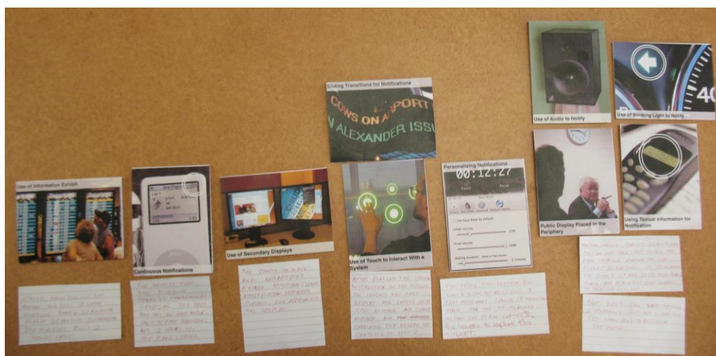
Figure 3. An example of a storyboard created by reusing the cards. The narrative serves to bring context and integrate the cards together.

We believe that the nature of combined imagery and rationale is a primary factor in facilitating designers in brainstorming and considering consequences at the same time. Reusing ideas of the past may be beneficial, but the application of these ideas in new ways and forms may bring out potentially innovative solutions.