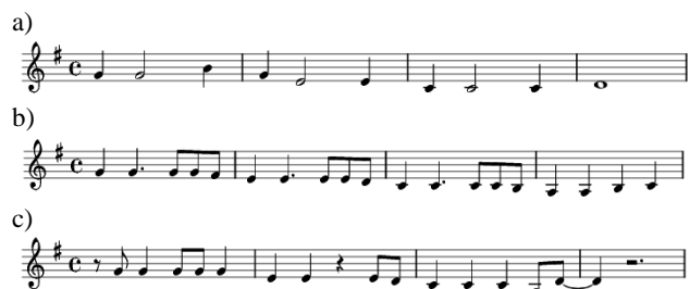
Figure 3. Three melodies by participants: a) JOE28, b) JAG23, c) MAR17

For possible cases of independent (re-)creations these quite similar pairs of melodies make a good point. Yet, no final conclusion can be reached, as these similarities could be explained by the simple process of following the roots of a given chord sequence. Thus, it could be argued that these melodies lack originality, particularly with hindsight to the context as set by the backing track, so the evident similarities could be deemed trivial.