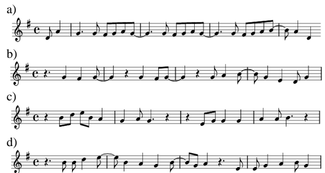
Figure 2. Four melodies: a) PINK, b) TK9683-1, c) COOKE, d) TK9683-2

1) Similarities between hit songs and subjects’ songs. In this case we arrived at two pairs with significant similarities: PINK vs. TK9683-1 (cf. Fig. 2a and 2b) and COOKE vs. TK9683-2 (cf. Fig. 2c and 2d). Interestingly, the two four-bar melodies originated from one single subject (TK9683), an experienced musician and songwriter, who had delivered an eight-bar melody with two clearly distinct four-bar parts, that entered the analysis as different four-bar melodies.