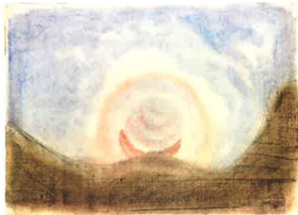
Rudolf Steiner, Nature Mood sketches: Moonrise (1922) and Moonset (1922) (Stebbing 2008, 98).