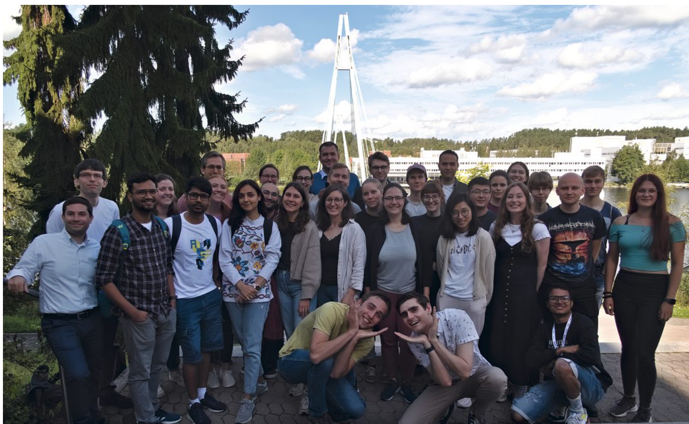
Group photo of participants taken at the end of the summer school course.

participants took advantage of a nearby water park, and others opted for biking. The end of most evenings ended all together, sharing a moment on the pier of the hotel or in the city. The social aspect served to motivate and inspire all the participants.