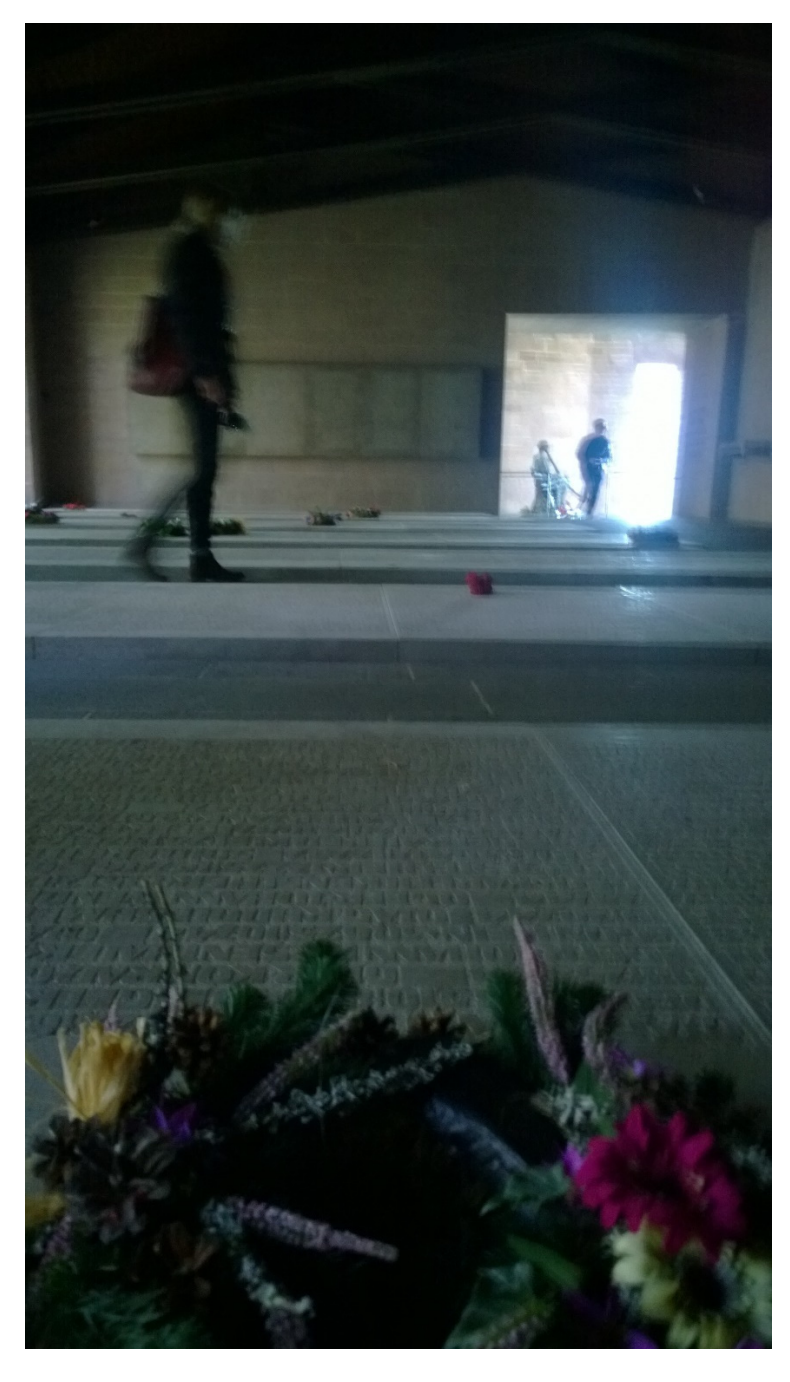
Images 6 and 7 . The Mausoleum of the Norvajärvi German Cemetery. Photo 6 by Suzie Thomas, photo 7 by Eerika Koskinen-Koivisto, 2015.