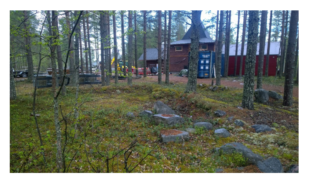
Image 2: WWII remains near Santa Claus Village, Rovaniemi. Photo by Eerika Koskinen-Koivisto, 2015.

During our fieldwork in Lapland, we discovered sites that have been deliberately avoided and thus collectively forgotten These kinds of places have been seen as sites of forgetting or oblivion (lieux d'oubli) that are avoided because of "the disturbing affect that their invocation is still capable of arousing". Some of these sites are located in the plain wilderness far away from human settlements, but interestingly enough, there are also those located right next to tourist attractions. One of them is Santa's Village, the most popular tourist attraction of Rovaniemi, built right on the site of a former German Military base. This information is not indicated anywhere in the area and the former military history of the area is not used in any way in the tourism business. WWII history is clearly problematic when it comes to international tourism, and this is understandable.