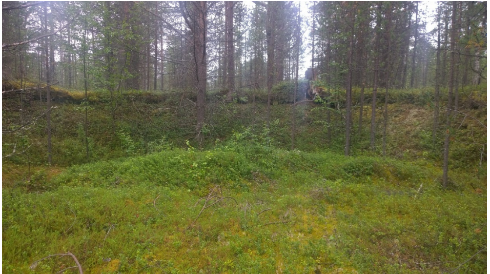
Images 4 and 5 : Trench and information signs with QR codes at the Outdoor Museum of Siida.

In theorizing the politics of commemoration, Jay Winter has divided the silences around war into three categories: (1) Liturgic silence motivated by loss and grief; (2) strategic and political silence that aims at balancing the contradictory ideologies and views of the past, and (3) essentializing silence that indicates who