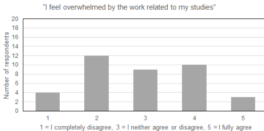
Figure 1. Student experiences regarding their levels of study burnout based on the item “I feel overwhelmed by the work related to my studies” (N = 38).

Regarding RQ1, some students seemed to experience study workload stress at a very early stage of their studies. The average of the sum variable measuring student study burnout was 2.5 (SD = 0.9). Every second respondent (50%) agreed they were often worried about studying in their free time. One-third of the respondents (34%) agreed with the claim “I often have feelings of inadequacy in my studies”. Also, more than one-third (34%) felt overwhelmed with schoolwork. Over one-third (37%) of students agreed with the claim “I used to have higher expectations of my schoolwork than I do now”. Almost one-fifth (18%) agreed that they were not sleeping well because of study issues. Student experiences of study burnout varied already at the beginning of their studies. Figure 1 illustrates the typical distribution of the responses concerning study burnout (Item 1 in Table A-1). All nine items measuring study burnout with their means and standard deviations are shown in Table A-1 in the Appendix.