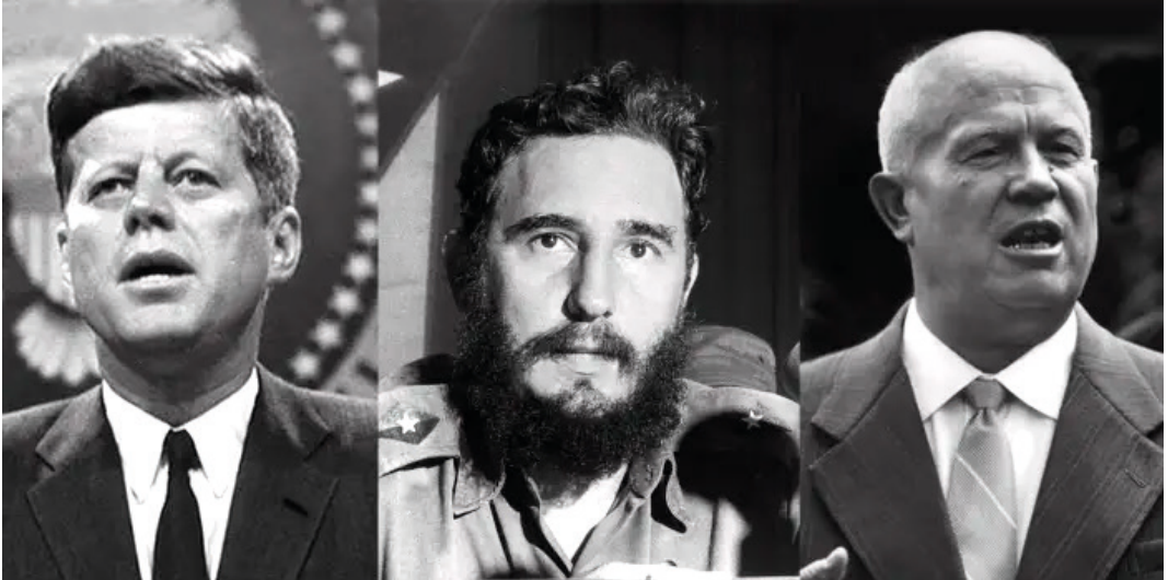
The three main characters of The Cuban Missile Crisis in 1962 were John F. Kennedy, Fidel Casto and Nikita Krushchev.