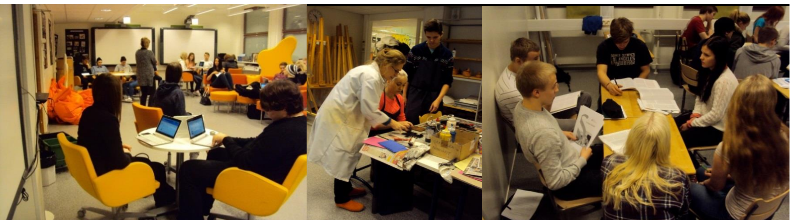
Figure 1. Learning situations differ in terms of space, participants, processes and tools. They include individual work, teacher–student interaction and student–student interaction, group work and one-to-many communication (when the teacher or a student is addressing the whole class).

Similarly, we asked the informants to assess a second list of 19 features using a negative lens, that is, whether or not a particular feature made learning more challenging. This task yielded a characterization of the features from the opposite perspective.