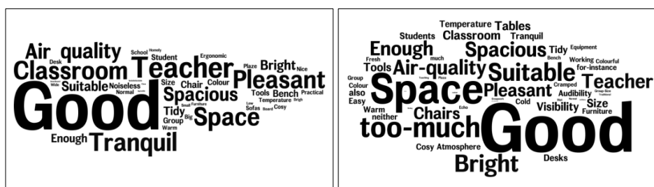
Figure 2. Word clouds of prevalent characteristics of an inspirational and motivational learning space. Left: The most common terms from the male students' descriptions. Right: The most common terms from the female students' descriptions.

The spatial basket included metric features (e.g. volume, access, route, distance and layout). Air quality, temperature, visibility (lighting) and audibility (soundscape) belonged in the sensory basket. The social basket included teacher–student interaction, instructional methods, group size, number of students in the school, school atmosphere as well as the calm/restlessness and tidiness of the place. The instrumental basket included equipment, the quality and reliability of tools, and practical and ergonomic considerations regarding the desks and chairs.