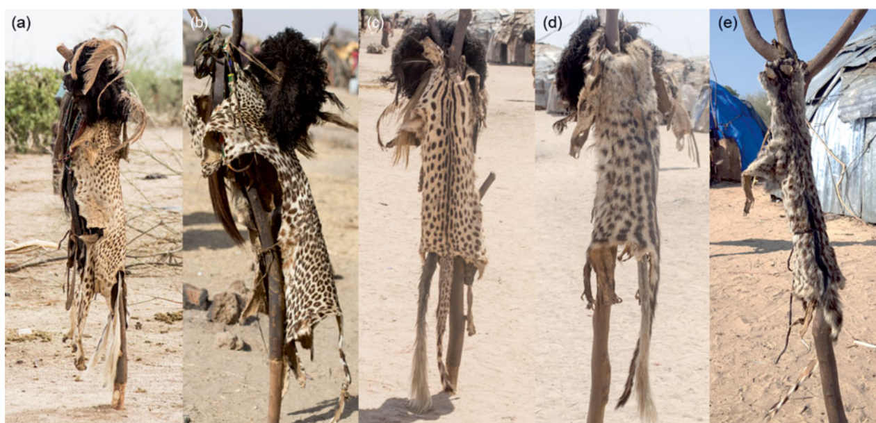
PLATE 2 Skins of species used in Dimi ceremonies: (a) cheetah Acinonyx jubatus , (b) leopard Panthera pardus , (c) serval Leptailurus serval , (d) African civet Civettictis civetta , and (e) common genet Genetta genetta , with ostrich Struthio molybdophanes feather headdresses (a–d).

common genet Genetta genetta and serval Leptailurus serval (Table 1, Plate 2c–e). Most (83%) of the cheetah and leopard skins were old, whereas most (64%) of the civet, genet and serval skins were fresh (Table 1).