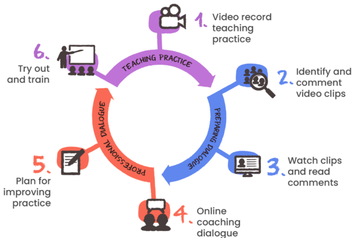
Fig. 1. The INTERACT coaching cycle.

Consistent with the state-of-the-art literature, the coaching process is one in which TSI experts work in partnership with teachers to discuss classroom practices in a way that is a) individualized, including one-to-one sessions; b) intensive, involving interaction every