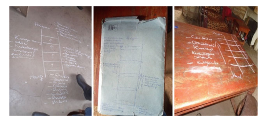
Fig. 1 Samples of field participatory discussion frames of 'ladder of citizenship'

which the acquisition and learning of the characteristics of perceived good citizenship were discussed. The concrete articulations of learning were further combined into five categories, which illustrate the diverse ways in which learning was conceptualized.