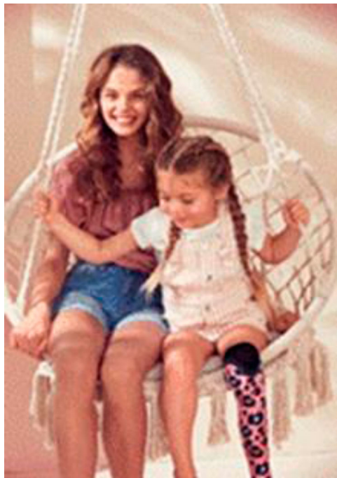
Figure 6. Image URL: https://www.facebook.com/KappAhlSuomi/photos/a.1538935169722245/2660784260870658/?type=3&theater. Source: https://fi-fi.facebook.com/KappAhl/. Date of access: 10 July 2020. Reuse not permitted.