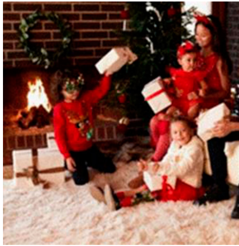
Figure 5. Image URL: https://www.facebook.com/KappAhlSuomi/photos/a.1538935169722245/2523190361296716/?type=3&theatre%5C. Source: https://fi-fi.facebook.com/KappAhl/. Date of access: 10 July 2020.

the camera while the girl child gazes at the floor. Though the older girl is not directly caring for the girl child in this image, she is pictured alongside a child with a plastered leg hence someone potentially in need of care.