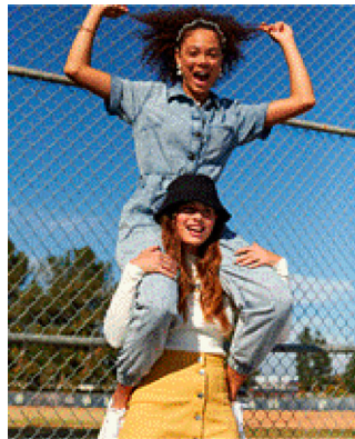
Figure 14. Image URL: https://www.facebook.com/hmsuomi/photos/a.1923897201169167/3266748903550650/?type=3&theater. Source: https://fi-fi.facebook.com/hmsuomi/. Date of access: 10 July 2020.

This image shares certain features with Figure 13 that was discussed under the visual construction of active self-presenters and self-surveyors. In both images girls are shown having fun in an outdoor environment. However, we chose not to categorise that image under the visual construction of carefree girls because we noted several essential differences between the two images. Girls in this visual construction are having fun with each other, whereas the girls in Figure 13 are engaged in acts like looking at themselves in the mirror or taking selfies that seem to construct them as self-conscious. The textual emphasis in Figure 13 is on the self-presentation of girls.