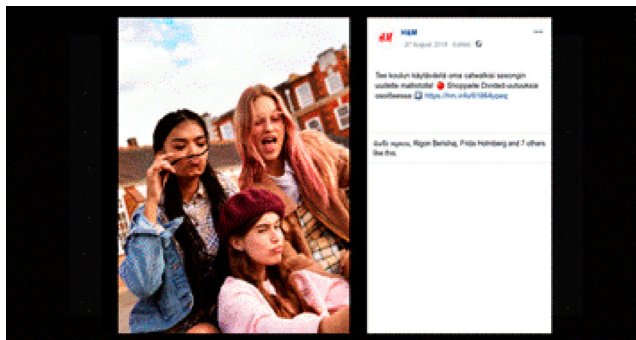
Figure 13. Image URL: https://www.facebook.com/hmsuomi/photos/a.1923897201169167/3080119108880298/?type=3&theater. Source: https://fi-fi.facebook.com/hmsuomi/. Date of access: 10 July 2020.

Both the images in Figures 11 and 12 portray girls as actively and confidently presenting themselves. Similarly, Figure 13 shows them as engaged in self-surveillance, with the text calling upon them to make active choices in buying new clothes to present their bodies. Therefore, these images together articulate the notion that girls are “naturally” inclined towards self-presentation and practise self-surveillance, but it has been well-packaged in ideas of choice and agency that characterise postfeminist girl power discourses using textual and visual strategies.