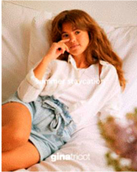
Figure 8. Image URL: https://fi-fi.facebook.com/GinaTricot/photos/a.10150107818417896/10157505646827896/?type=3&theater. Source: https://fi-fi.facebook.com/GinaTricot/. Date of access: 10 July 2020. Reuse not permitted.

However, the theme of innocence is distinct in both images and gets expressed through the predominantly white background and the dreamy look on the girls' faces. By picturing an older girl in a manner reminiscent of a young child, Figure 7 helps in reproducing the traditional discourse of girlhood innocence and sustains the notion that older girls are primarily asexual. Figure 8 produces the notion of girlhood innocence but intermixes it with sexuality by playing with both elements.