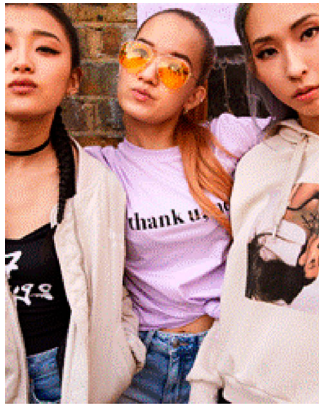
Figure 10. Image URL: https://www.facebook.com/hmsuomi/photos/a.1923897201169167/3057059124519630/?type=3&theater. Source: https://fi-fi.facebook.com/hmsuomi/. Date of access: 10 July 2020.

at the camera and so at the onlooker of the image. The words “thank u, next” are inscribed on her T-shirt, making an intertextual reference to Ariana Grande’s popular song about her multiple ex-boyfriends (Grande 2018). The visual arrangement makes both the girl and the words inscribed on her T-shirt prominent. The latter viewed along with the pouting, winking and her heavy eye makeup—that accentuates the wink—give the image of the girl a sexualised character. It makes one wonder if the “next” in “thank u, next” indicates sexual frivolity. It could even be read as a mark of power, suggesting that the girl can choose and dismiss who she courts, thus signifying individual choice and agency.