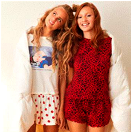
Figure 7. Image URL: https://www.facebook.com/hmsuomi/photos/a.1923897201169167/3180550135503861/?type=3&theater. Source: https://fi-fi.facebook.com/hmsuomi/. Date of access: 10 July 2020.