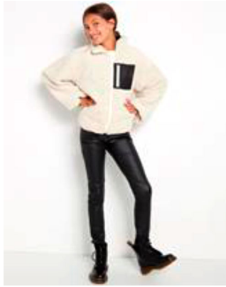
Figure 11. Image URL: https://www.facebook.com/Lindex/photos/a.10150778194024094/10156985254999094/?type=3&theater. Source: https://fi-fi.facebook.com/Lindex. Date of access: 10 July 2020. Reuse not permitted.