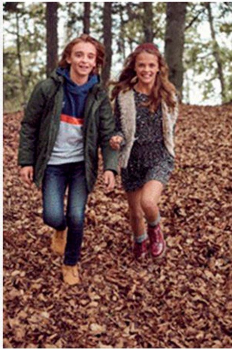
Figure 2. Image URL: https://www.facebook.com/KappAhI Suomi/photos/a.1538935169722245/2438498443099242/?type=3&theater. Source: https://fi-fi.facebook.com/KappAhI/. Date of access: 10 July 2020.