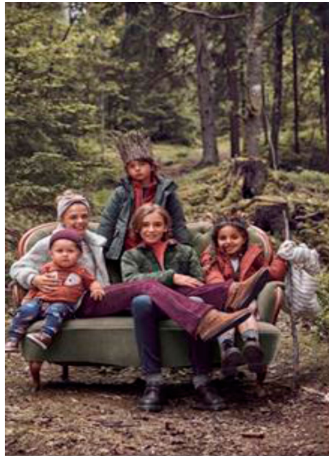
Figure 4. Image URL: https://www.facebook.com/KappAhlSuomi/photos/a.1538935169722245/2438497956432624/?type=3&theater. Source: https://fi-fi.facebook.com/KappAhl/. Date of access: 10 July 2020.

The fourth image (Figure 4) shows a group of children of varying ages sitting on a sofa that appears to be placed surprisingly in the middle of a forest. The oldest-looking girl and boy are sitting together. A toddler sits near the girl, and older children (older than the toddler) occupy the sofa with them. The visual arrangement bears an intervisuality with a heteronormative nuclear family posing for a family photograph. Heteronormativity even gets expressed in how the girl and the boy, visually presented as the two oldest, sit next to one another with the girl's legs placed comfortably on the boy's lap signifying familiarity and fun.