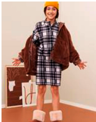
Figure 12. Image URL: https://www.facebook.com/Lindex/photos/a.10150778194024094/10156879744324094/?type=3&theater. Source: https://fi-fi.facebook.com/Lindex. Date of access: 10 July 2020. Reuse not permitted.

Both images deploy gestures that indicate confidence. In Figure 11, gestures like the girl facing the camera with a smile, hands on her waist, chin up, heels resting on the floor and the toes of a foot in the air reflect confidence. In Figure 12, confidence is indicated through gestures like the girl