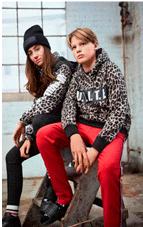
Figure 3. Image URL: https://www.facebook.com/KappAhI Suomi/photos/a.1538935169722245/2282798822002539/?type=3&theater. Source: https://fi-fi.facebook.com/KappAhI/. Date of access: 10 July 2020.