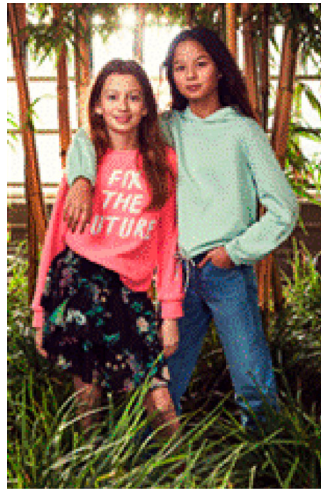
Figure 15. Image URL: https://www.facebook.com/KappAhlSuomi/photos/a.1538935169722245/2596914433924308/?type=3&theater. Source: https://fi-fi.facebook.com/KappAhl/. Date of access: 10 July 2020. Reuse not permitted.