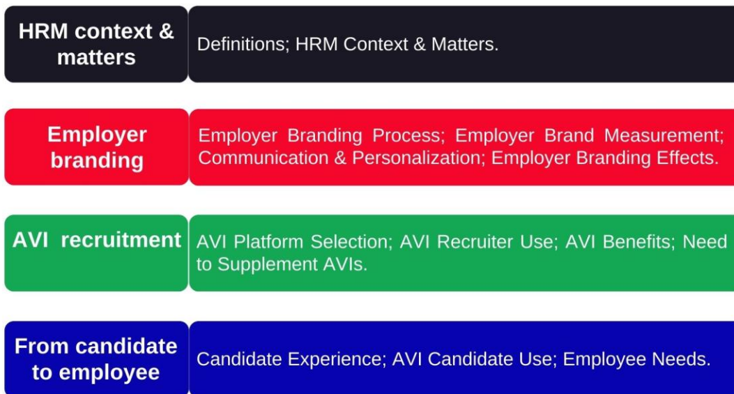
Fig.1.5 Aggregate dimensions of RecRight’s digital content

data of LinkedIn users with the goal of subsequently comparing them (see 1.4). In the following subsections, reference to RecRight’s quotations is made by page number, followed by the publication number. Publication 1 represents “Video Recruitment–The Ultimate Guide,” and publication 2 represents the “Employer Branding and Recruitment Handbook.” For instance, quotations could take the following form: “...” (p. 5, 1) or “...” (p. 12, 2). Because RecRight refers to AVIs by the term “video interviews” in the two documents analyzed, each quotation replaces the term “video interview(s)” with “AVI(s)” to be more accurate. Although RecRight’s content may seem redundant regarding definitions and concepts in the literature review, we have presented them to expose what is conveyed and targeted to recruiting organizations to foster those organizations’ adoption and deployment of AVIs for hiring.