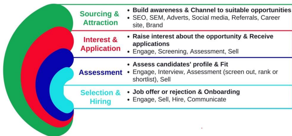
Fig. 1.1 The recruitment funnel in the digital age (adapted from Headworth 2015). From sourcing, attraction, interest, application, and assessment all the way to selection and hiring, different marketing tactics are used to engage talent across the recruitment process.

Specifically, organizations send signals (ref. signaling theory ) to prospective workers during the recruitment process to build trust through a well-informed, consistent, smooth, and enjoyable experience across the media (Wilden et al. 2010) from the inception of the hiring process, thereby setting job seekers' expectations (Allen et al. 2007). These expectations , even though they may not be well-informed, usually influence job seekers' identification of their favorite prospective employers early on, and the remainder of their decision-making mostly entails the confirmation and rationalization of their early judgments (Allen et al. 2007; Soelberg 1967). Thus, the adoption and implementation of a recruitment funnel (Headworth 2015) is deemed worthwhile.