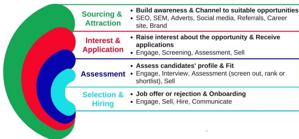
Fig. 1.1 The recruitment funnel in the digital age (adapted from Headworth 2015). From sourcing, attraction, interest, application, and assessment all the way to selection and hiring, different marketing tactics are used to engage talent across the recruitment process.

Specifically, organizations send signals (ref. signaling theory ) to prospective workers during the recruitment process to build trust through a well-informed, consistent, smooth, and enjoyable experience across the media (Wilden et al. 2010) from the inception of the hiring process, thereby setting job seekers' expectations (Allen et al. 2007). These expectations , even though they may not be well-informed, usually influence job seekers' identification of their favorite prospective employers early on, and the remainder of their decision-making mostly entails the confirmation and rationalization of their early judgments (Allen et al. 2007; Soelberg 1967). Thus, the adoption and implementation of a recruitment funnel (Headworth 2015) is deemed worthwhile.