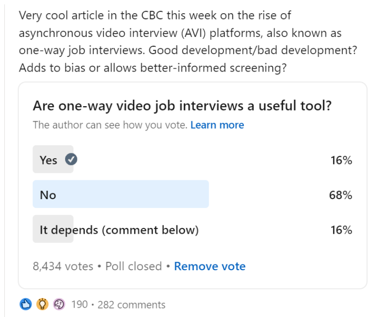
Fig. 1.3 Reference post of the first post in the LinkedIn news thread for “Meet the one-way interview”

All these comments were analyzed with the intention to respond to RQ1: What are the perceptions of potential hires about video interviews? In this regard, they were coded to isolate “patterns and relationships between variables and themes” (Given 2008, p. 121). What LinkedIn potential hires think and why they think that way emerged in the comments. All comments were uploaded to Atlas.ti and coded inductively while considering what had previously been read about video interviews, recruitment, and employer branding.