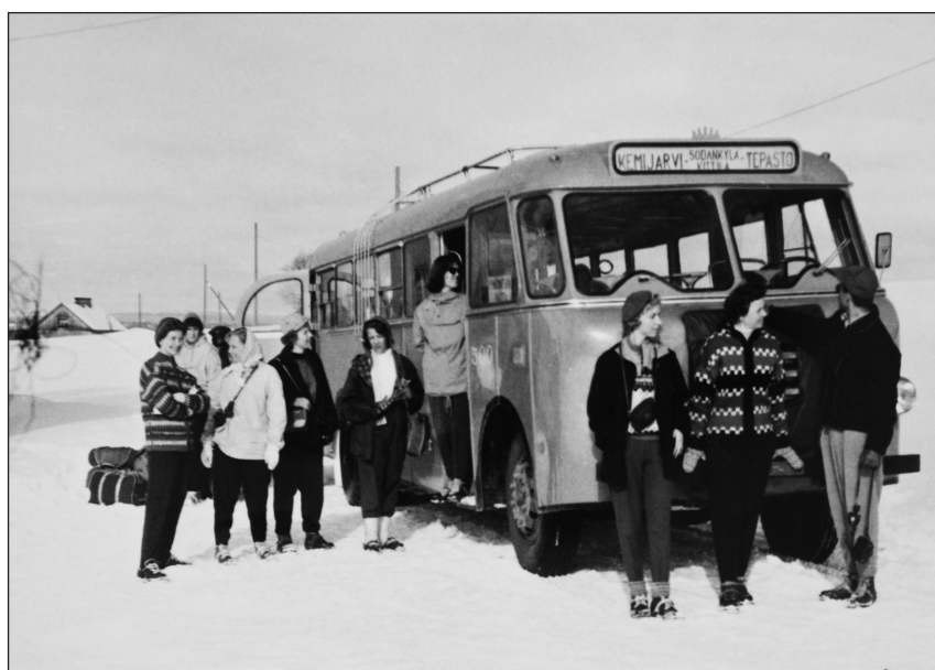
Figure 2: Skiing fashion in the late 1950s. (Photo: Juha Jernvall, Helsinki City Museum).

Respondents' stories point to the fact that Finns became consumers of mass-produced, ready-made goods in the 1960s and 1970s, much later than the United States and other Western countries. The ready-to-wear industry started to grow after the war, and in the 1960s when Finland was beginning to reach the standard of living of Western Europe, a wide selection of consumer goods replaced the previous shortages (Lappalainen & Almay 1996: 224–225; Autio 2019: 205–211; Frisk 2019).