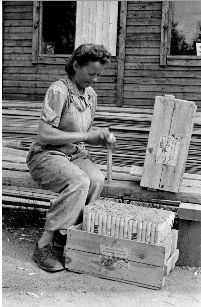
Figure 1: It became socially acceptable for women to wear trousers and dungarees in Finland as workwear during the Second World War.

and generations (Stark 2009). The decisions and behaviours of people who lived through it were influenced by the immediate options available to them as well as their hopes and expectations regarding change. In order to understand their behaviours, we must seek to situate their choices in their contemporary contexts (Stark 2009: 5).