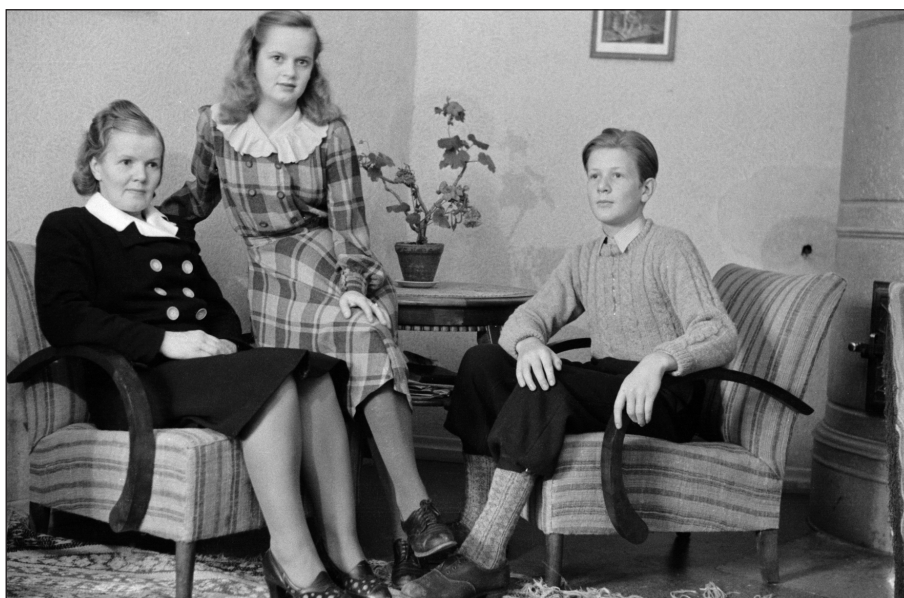
Figure 4: A Finnish mother with her children in formal dress in 1940; trousers were only worn by her son.