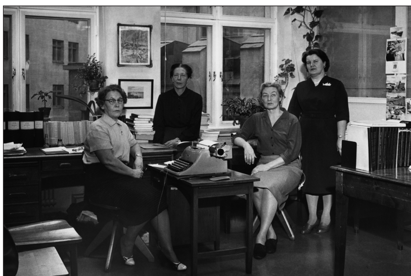
Figure 5: The female staff of the statistics office of the City of Helsinki followed the contemporary formal dress code by wearing a skirt as workwear in 1961.

the body can be used and moved (Mauss 1973; Sweetman 2001: 66; Woodward 2007: 17). We do not normally experience our clothes because they are like our second skin (Entwistle 2000). We only become aware of them when we are dressed uncomfortably as it makes us aware of the “edges”, the limits and the boundaries of our body (Entwistle 2001: 45). My respondents’ personal narratives show that only those women for whom trousers “felt right”, who felt at ease in their bodies when wearing trousers, adopted them as part of their wardrobe; others wore them only occasionally, if at all.