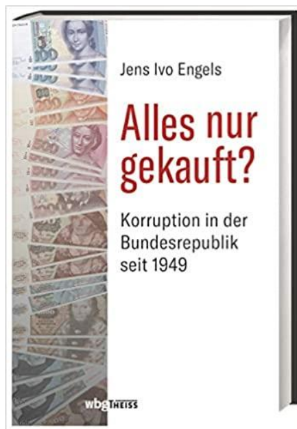
Figure 2. Engels, Jens Ivo, Is Everything Merely Bought? Corruption in the Federal Republic of Germany since 1949 ( Alles nur gekauft? Korruption in der Bundesrepublik seit 1949 . Wissenschaftliche Buchgesellschaft, Darmstadt, 2019, 399 pages)