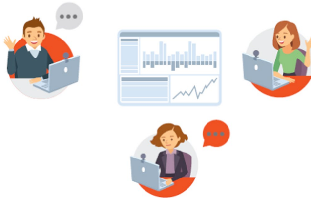
Figure 2. Virtual setting of the simulation game: students remotely connected to the simulation are looking at the same view on their computer screens while engaged in a synchronous discussion using VoIP.

teamwork and which software solutions they would use for organizing their teamwork and for communicating.