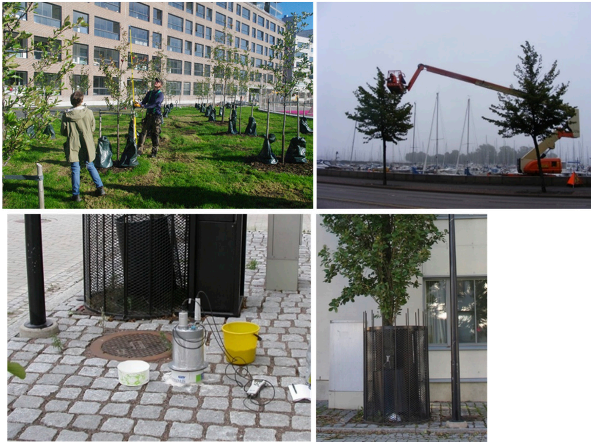
FIGURE 1 | (A–D) clockwise]. Measurements of tree dimension from young trees in Hyvääntoivonpuisto (A) and demonstration of how complicated can the collection of leaf biomass samples from street trees higher than 2–3 m be (B) . Portable chamber system with infrared carbon dioxide analyzer and temperature and relative humidity probe for soil CO 2 flux measurement (C) . Sensors installed on urban tree trunks can be protected by surrounding the entire tree base in custom made steel mesh cage (D) .

The effects of biochars on native soil C (priming effect) over time are relevant to be considered as well. The priming effects can even have a larger impact on C sequestration potential than the direct effect of biochar addition, and first long-term field studies on the issue are promising (Weng et al., 2017; Blanco-Canqui et al., 2020). Namely, biochar addition has been found to enhance soil aggregation and hence, the retention of root-derived C by 20% in 10-year experiment in Australia (Weng et al., 2017) and in Midwestern United States, a SOC increase by twice the amount of biochar C applied was reported 6 years after biochar application (Blanco-Canqui et al., 2020). Thus, long-term experiments combined with repeated and representative soil sampling (including subsoil) are one way for the verification of biochar and SOC sequestration.