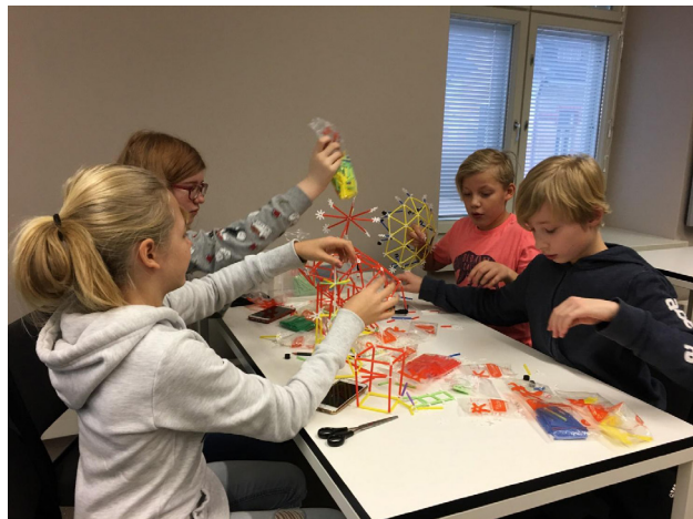
Figure 3: Imaginative, creative windmills, models of geometric amusement park game designs.

used in this study, consisted of: 1. Understanding science will benefit me in my career (pre: .723; post: .823), 2. I am confident I will do well on science tests (pre: .850; post: .882), 3. Learning science will help me get a good job (pre: .784; post: .802) and 4. I will use science problem-solving skills in my career (pre: .707; post: .763).