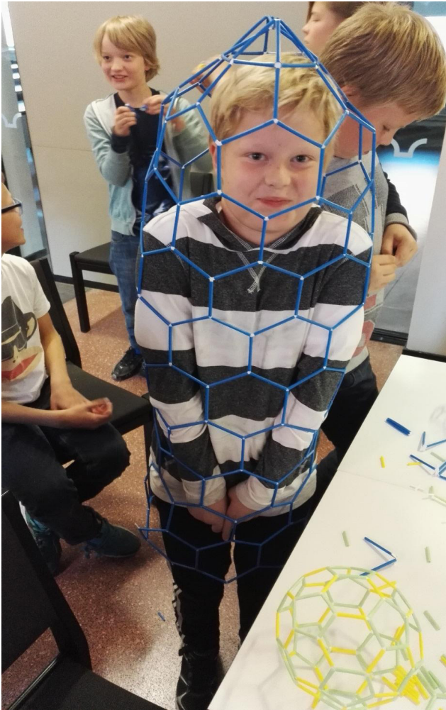
Figure 1: The 4Dframe Buckyball and carbon nanotube was built in a collaborative problem-solving process. In the playful flow of the team's activity, the carbon nanotube was creatively transformed into a funny costume.

a new way (pre: .715; post: .781), 3. Made a connection between a current problem or task and a related situation (pre: .667; post: .735), 4. Imagined a potential solution in a new way (pre: .642; post: .688) and 5. Tried to generate as many ideas as possible when approaching a task (pre: .466; post: .614). The second component "Flow" consisted of: 1. Lost track of time when intensely working (pre: .721; post: .854), 2. Felt that work was automatic and effortless during an enjoyable task (pre: .712; post: .680) and 3. Being fully immersed in your work on a problem or a task (pre: .710; post: .761). (Two items were omitted because of similar and high cross-loadings).