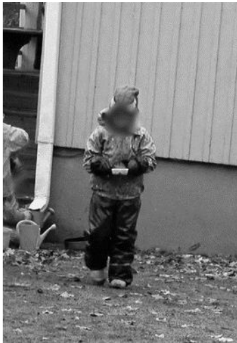
FIGURE 4 Movement of water in a container from one place to another

day of the autumn videoing, the weather was rainy and cool, and the air humidity was very high at about 95%, which may have contributed to John's low level of physical activity. Studies have shown that cool and rainy weather may have a detrimental effect on children's physical activity (Carson & Spence, 2010). In contrast, rainwater in its various states (e.g., flowing from gutters, forming ponds or absorbing into the sand) may serve as a physically activating stimulus, which our findings may also suggest (Appendix 2). For example, water as an irregular natural material can stimulate children's imaginations and creativity (Bento & Dias, 2017) and thus inspire the movement of water in containers from one place to another (Figure 4).