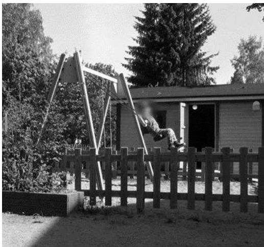
FIGURE 9 Riding a swing

Previous large-sample studies using motion sensors on children's PAA and SA in ECE settings have found swing equipment limits children's physical activity levels (Cardon et al., 2008; Gubbels et al., 2012). In this study, which used direct continuous observation of an individual child, the experienced investigator was able to observe that while increasing