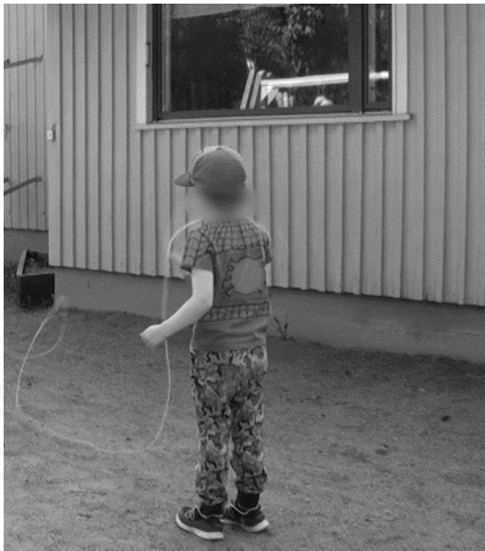
FIGURE 8 Jump rope manipulation

Iivonen, Niemistö, Sääkslahti & Kettukangas.