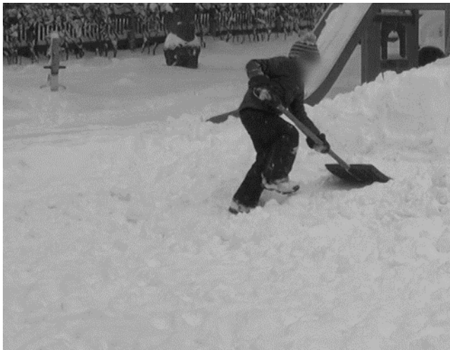
FIGURE 7 Shoveling snow

yard. The findings of this study may suggest that such an environment with snow piles and the availability of equipment, such as shovels (Figure 1 e.) and bumps, suitable for snow activities may physically activate a child in winter (Figure 7). For example, shovelling has been shown to be an activity that more than quadruples children's physical energy expenditure compared to their resting level (Butte et al., 2018). Previous Norwegian studies have shown that moving in the snow can have additional benefits. Bjørgen's (2015) study in one ECE unit indicated that during outdoor play, children's well-being, involvement and intensity of physical activity were at their highest during snow activity situations. Another longitudinal Norwegian study showed that versatile physical activity in the wintery forest had beneficial effects on children's physical and motor performance (Fjørtoft, 2001).