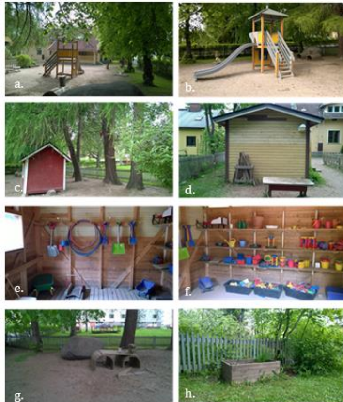
FIGURE 1 Photographs from the yard of the ECE unit: (a) the ECE unit building, (b) slide, (c) playhouse and trees, (d) the equipment storage unit, (e) equipment in the storage unit, (f) equipment in the storage unit, (g) the rock and (h) vegetation

The yard of the ECE unit was flat, about 40 by 30 metres (1200 m 2 ) in size, with a sandbox, a slide, swings, a seesaw, a playhouse and various play equipment in a storage unit, which children were allowed to pick up freely. There were some natural elements, such as eight trees, larger rock, grass, and other vegetation. The ECE unit building (about 20 by 10 metres) was at the other end of the yard (Figure 1).