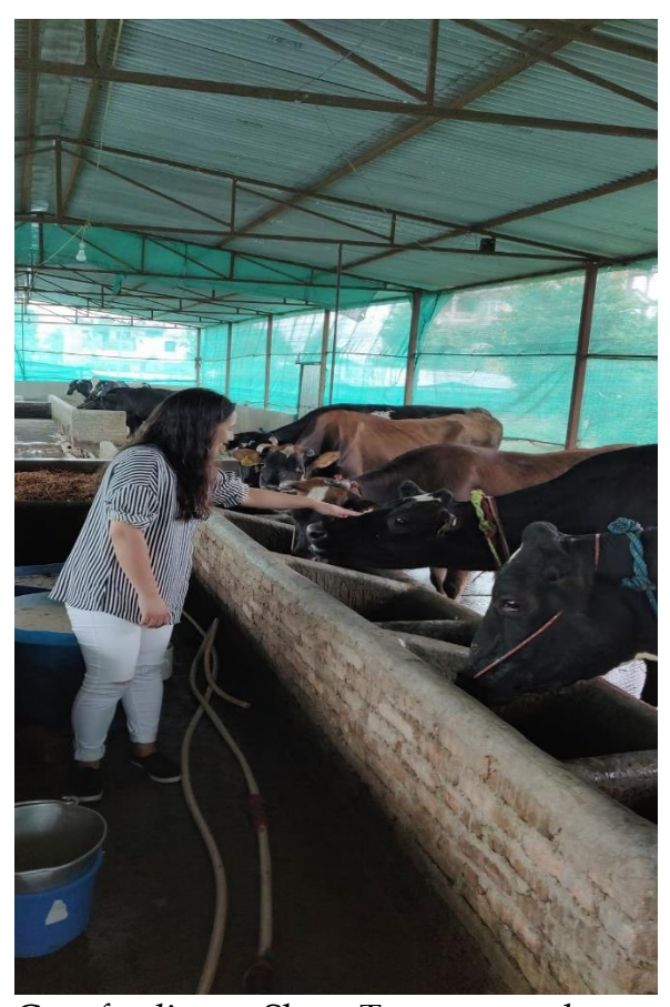
Cow feeding at Shree Tara cow and organic farm