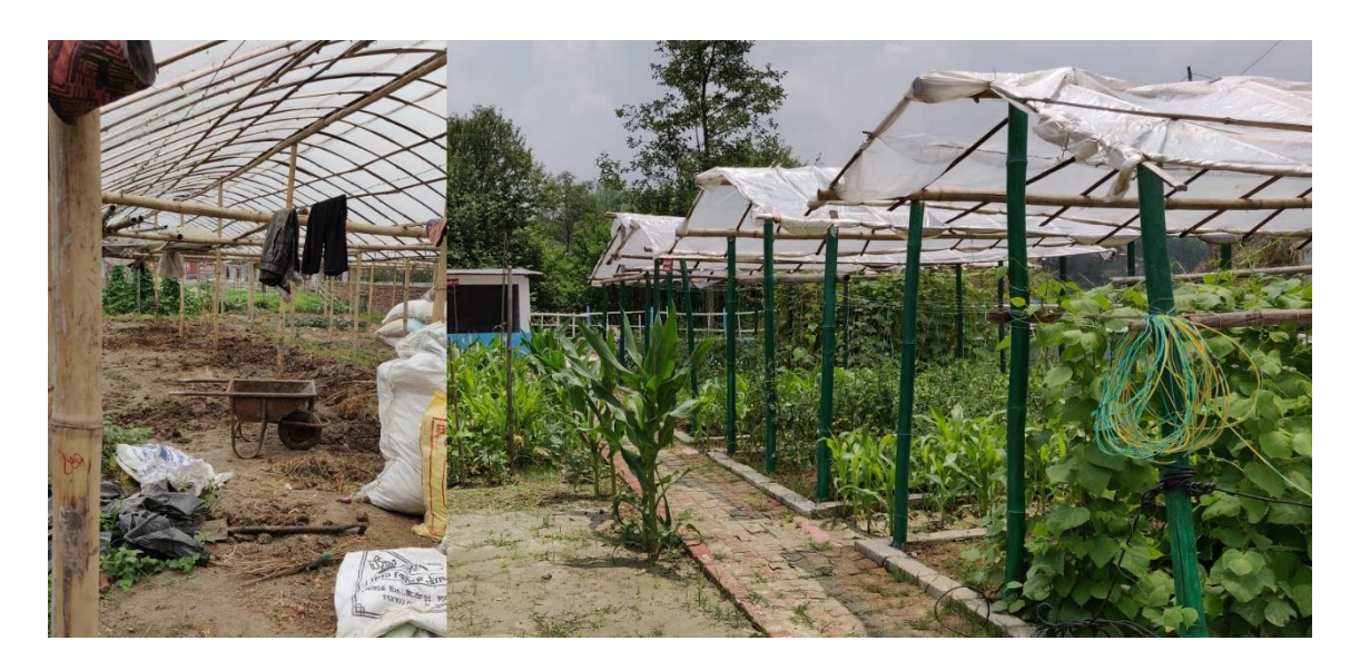
Before and after view of Panchawoti Agro farm