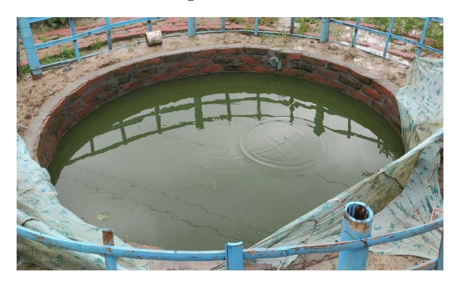
Construction of water storage reservoir in Panchawoti Agro garden