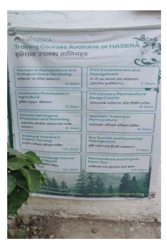
Hasera Training courses