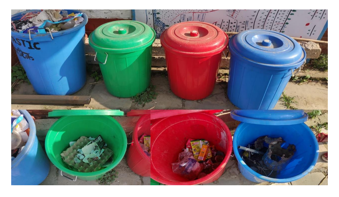
Initial phase of waste separation in Panchawoti home