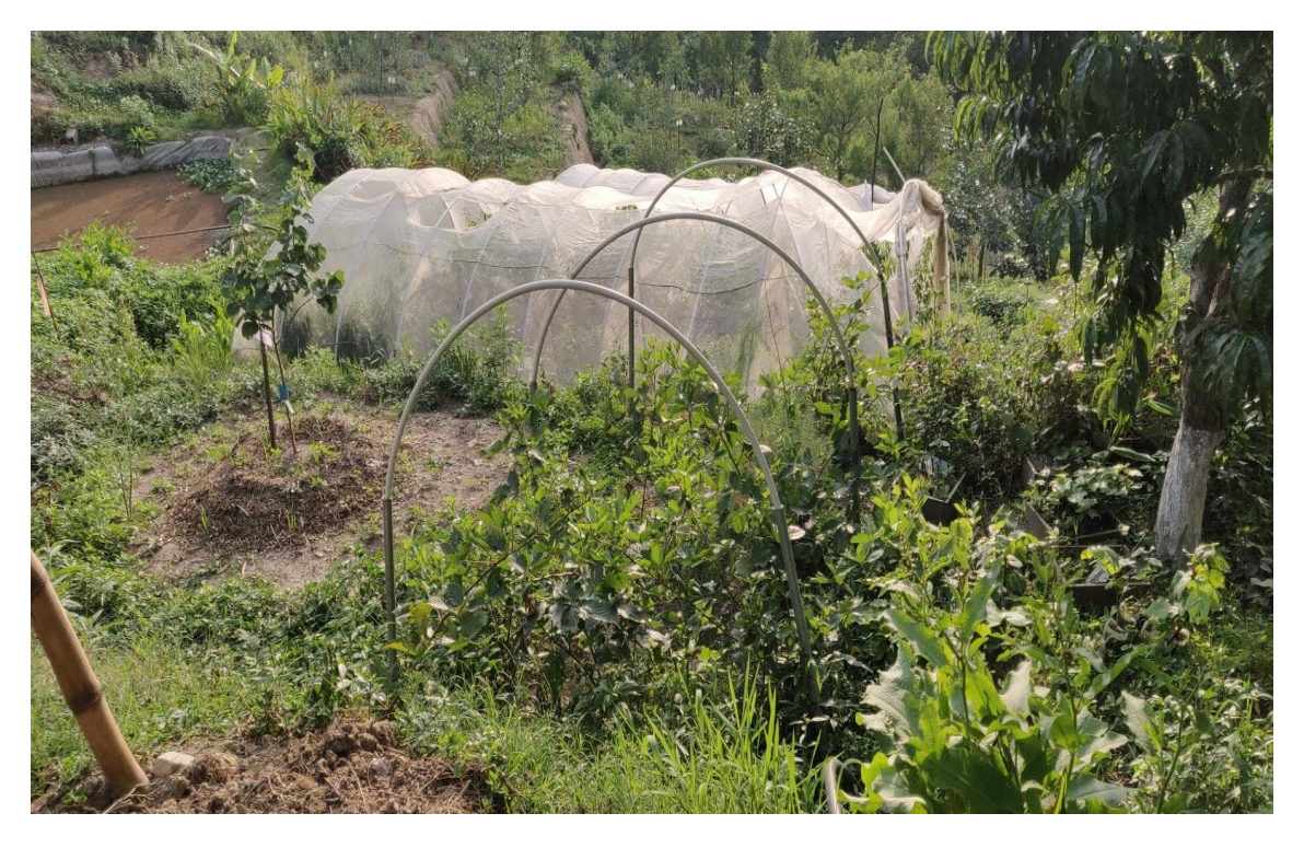
Biointensive farming at Everything Organic Nursery