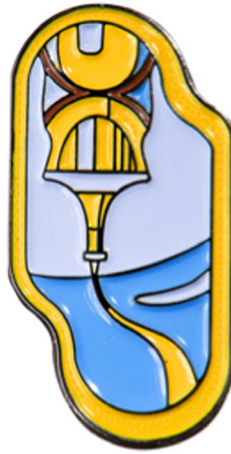
SKILL PINS AND SPIRIT PATCHES

Although players' achievements in these areas are recognised through the awarding of custom-made pins and patches in an intimate postseason ceremony, it is truly the whole crew that pushes our players to new heights.