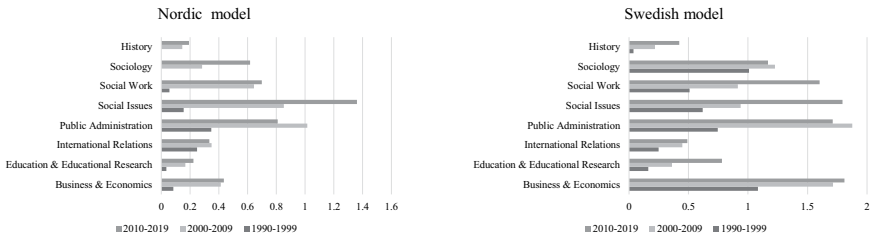
Figure 1.2 Share of articles using the Nordic and Swedish models as concepts in certain research areas from 1990 to 2019 (per mil from all articles in different time cohorts).