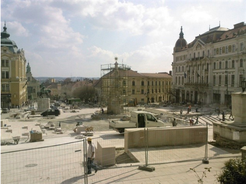
FIGURE 4.7 Renovating and constructing Széchenyi square in Pécs during its ECOC year.

repetitions, and reminders of other ECOCs. All cities seem to come up with very similar ideas and seek to emphasize the same ideals in their promotion of the European dimension. Some of the photos taken during the fieldwork are therefore so similar that their locations are difficult to tell based on the image alone. This similarity can be perceived as stemming from the nature of the ECOC action based on a competition and a set of selection criteria (Lähdesmäki 2014b). All the candidates seek to fit their applications, plans, and programmes into this framework, as well as to find and utilize the most recent trends in participatory culture, cultural regeneration, and revitalization of urban space. As a result, the ECOC action has succeeded in constructing a year-long urban event that we find very 'European' in a sense that its European dimension is constantly discussed, negotiated, debated, manifested, and, thus, constructed in it.