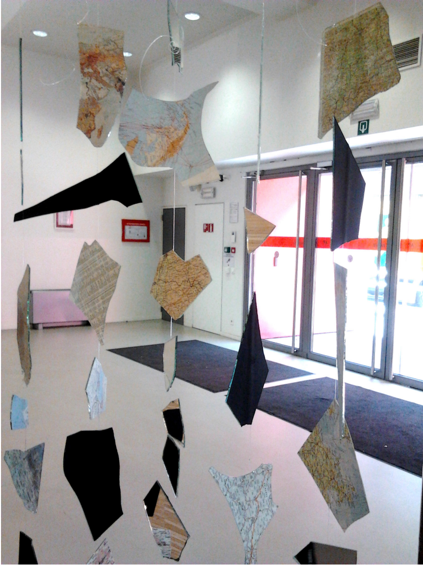
FIGURE 5.4 Shifting geographies of Europe in the ECC art exhibition at the dissemination conference in Antwerp.