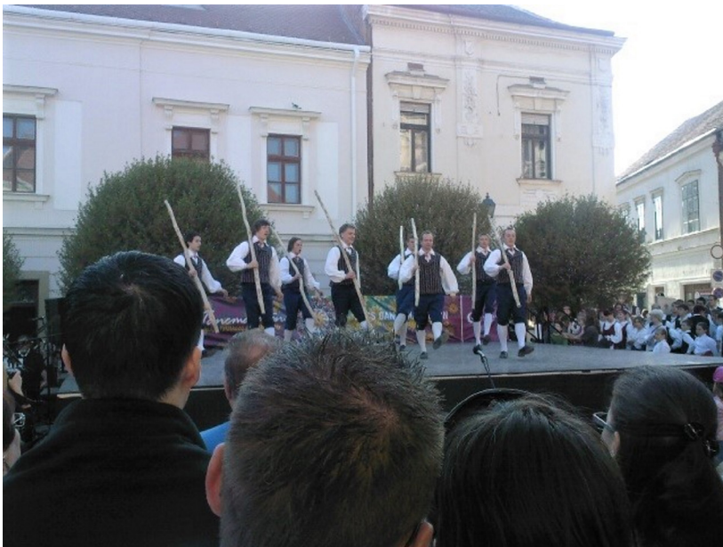
FIGURE 4.4 Finnish performers wearing folk costumes at the folk dance festival in Pécs2010.