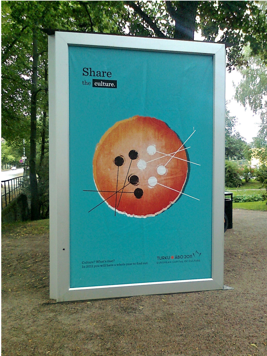
FIGURE 4.2 In Turku, the ECOC title was advertised in the city center through large sign boards that played with the logo of Turku2011.