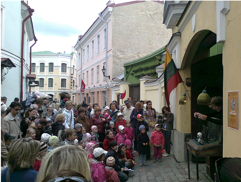
FIGURE 4.3 Outdoor performance by a Lithuanian group at the puppet theatre festival in Tallinn2011. The flag indicates the home country of the group.