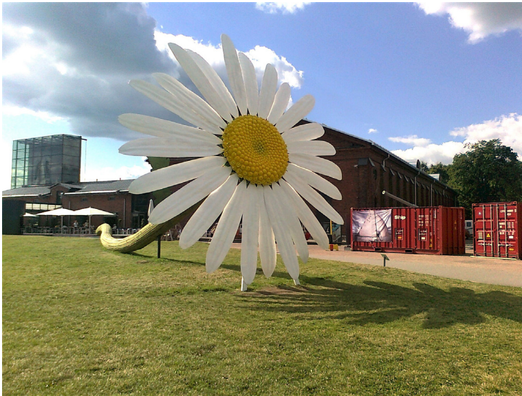
FIGURE 4.5 Daisy by Jani Rättyä and Antti Stöckell at the ‘Flux Aura’ environmental art festival in Turku 2011.

Rather than folk traditions, the ECOC programmes more commonly focus on contemporary urban culture. Programme events seek to enliven cities through contemporary public art and community art projects, aiming at bringing people together and enabling them to participate in diverse creative activities. This kind of contemporary urban culture invokes associations with European metropolises from where the latest street art and ‘cultural buzz’ spread to other urban environments. In the case ECOCs, it was difficult to overlook the new artistic projects in urban space. These projects commonly included temporary public art in squares or parks (Figure 4.5) or smaller street art projects enlivening the urban space and its structures (Figure 4.6) in the city centers.