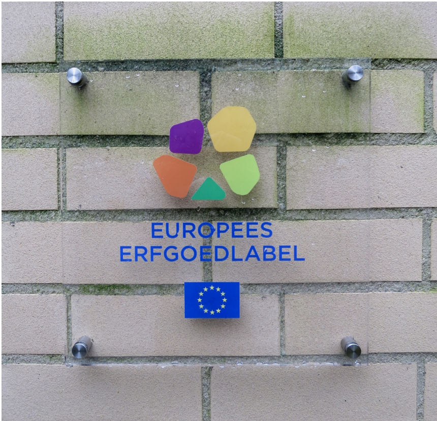
FIGURE 6.5 The EHL logo, photographed at Camp Westerbork, the Netherlands.

In the interviews, we also asked the visitors about their associations related to the EHL logo and two of its slogans ‘Europe starts here’ and ‘Europe starts with you’ (see also Lähdesmäki et al. 2020). The former is the official slogan of the EHL, which is used for presenting the EHL action at all sites, with the exception of Camp Westerbork, which uses the slogan “Europe remembers Camp Westerbork”. The slogan ‘Europe starts with you’ is found in the brochures and other promotional material informing interested heritage sites about the application aims and procedures. Both of these slogans are formulated by the Commission and used by the national coordinators of the action and the EHL practitioners at the awarded sites. The question about the slogans, thus, enabled us to explore the reception of the intertwined macro and meso-level EHL discourse at the micro level. During our interviews, most of the interviewees compared the slogans and usually preferred one to the other. Their interpretations of the slogans opened up a very interesting understanding about