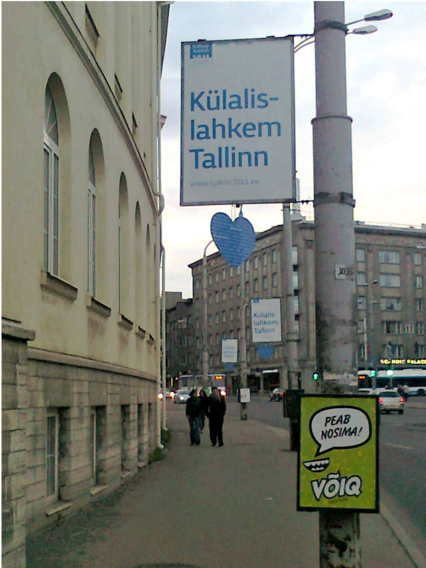
FIGURE 4.1 Sign boards with the ECOC title in a Tallinn street scene in 2011. The text on the board says 'More hospitable Tallinn'.

case ECOCs, the city centers were enlivened by foreign performers, performing groups, and audiences from different countries. The multinational nature of these events could be experienced through the multiplicity of languages used in the performances, heard among the audiences, and printed in the communication materials. The use of national flags in the events or the texts in the