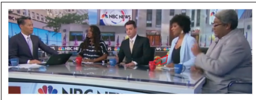
Figure 2b. Zerlina retracts her hand.