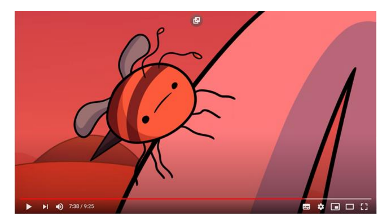
Figure 4. Red as a color of danger. Image from the video by TheOdd1sOut.

"The Spiders and the Bees" features two scenes that address James' profession as a YouTuber. The first of them follows a video clip from a documentary film where a researcher pulls silk out of a spider's behind. This is followed by him joking how telling his profession at a party is not that bad anymore, as well as an animated scene where he meets the spider researcher at a party and is very uncomfortable when hearing him describe what he does for a