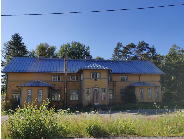
Figure 1 Accommodation building at the Oravais reception centre

The official capacity of the Oravais centre is 150 residents, but at its peak in 2015 the number of residents was triple that. Today there is a floating population of between 100 and 120 (Finnish Immigration Service 2019). These people are not included in the census, which is only completed by those with permanent residence status. However, given that they are from all kinds of backgrounds, and none of them claim either Finnish or Swedish as their main or dominant language, Oravais might be regarded as a superdiverse area, albeit not an urban one. Superdiversity, as defined by Blackledge et al. (2018, following Vertovec 2006, 2007) refers to: