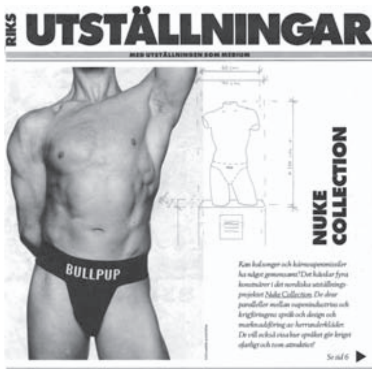
Nuke Collection. It's a boy! Riksställningar, Stockholm 1993.

them. The Swedish trademark Salming [the ice-hockey player] pants was sold in 1994 mainly during the time between Father's Day in November and Christmas, the buyers were wives and they preferred one colour garments (65 %) to white pants (only 10 %) (Gall 1993).