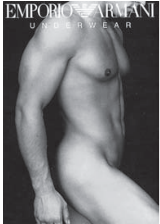
Unmentionable – unnecessary. Armani package from 1999.

The most special function of pants in gay culture is as a concretisation of sexual copulation. In gay magazines there are sperms damped, unwashed or sweated pants for sale. In the sexual situation wet underwear, licking the pants, is an important part of eroticism, also auto-eroticism. A gay informant told me that he is especially attracted to the white cotton material before it has been washed. To dress or to strip the male partner is a ritual of erotic tension.