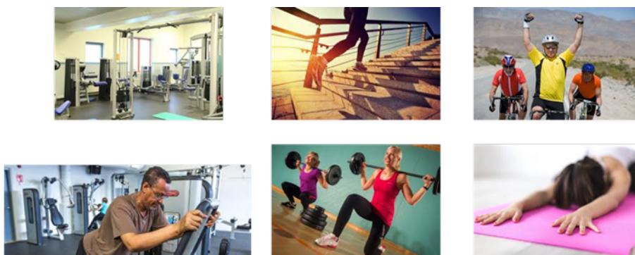
Figure 1: A selection of PA forms.

young elderly (Ainsworth et al. 2011). There will be imprecision and variation as the young elderly are in different physical shape. For instance, 150 minutes of brisk walking (MET 3.5) gives 525 MET-minutes per week. An active young elderly with a moderate PA history and of reasonable physical fitness should easily reach a weekly level of about 600 MET-minutes (subjective personal experience), that will give short- and long-term health effects. But PA programs need to be individual and will develop over time as young elderly get in better shape.