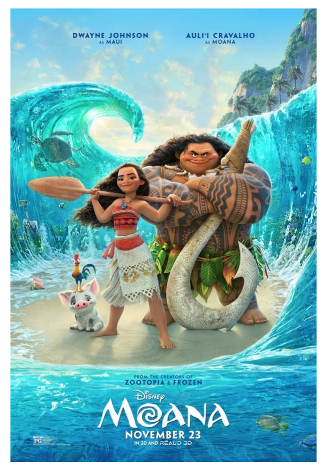
Retrieved from Internet Movie Database. <u>https://www.imdb.com/title/tt3521164/</u>. © 2016 Disney. Retrieved 2 April 2020.

I collected the data by watching the original, English-spoken version of the movie and consulting the Disney's official website. Nikolajeva does not provide a method for gathering the data, so I did not have any specific way of collecting the data. I chose all the instances that seemed to fit the categories. I also chose some instances that did not fit the categories but are different from