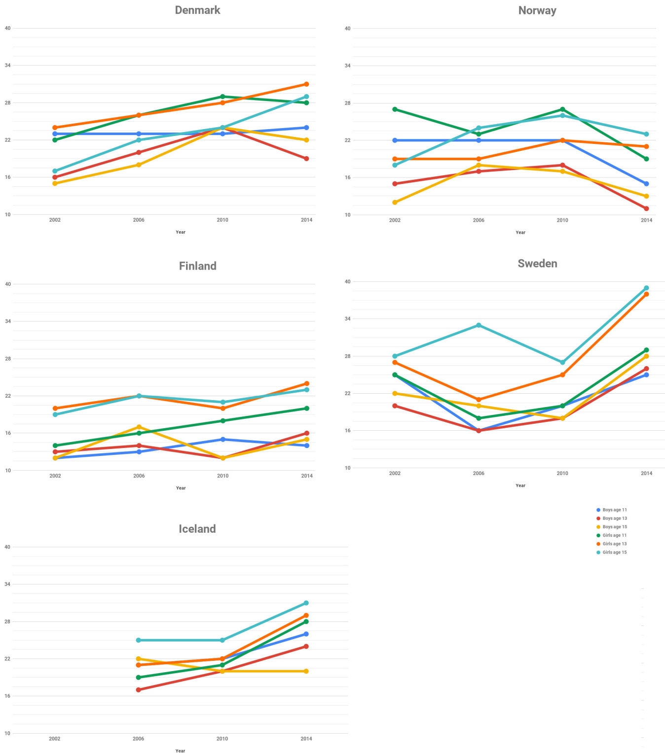
Figure 2. Sleep difficulty, prevalence (%) of more than weekly sleep difficulties, by age and gender by year, grouped by country.