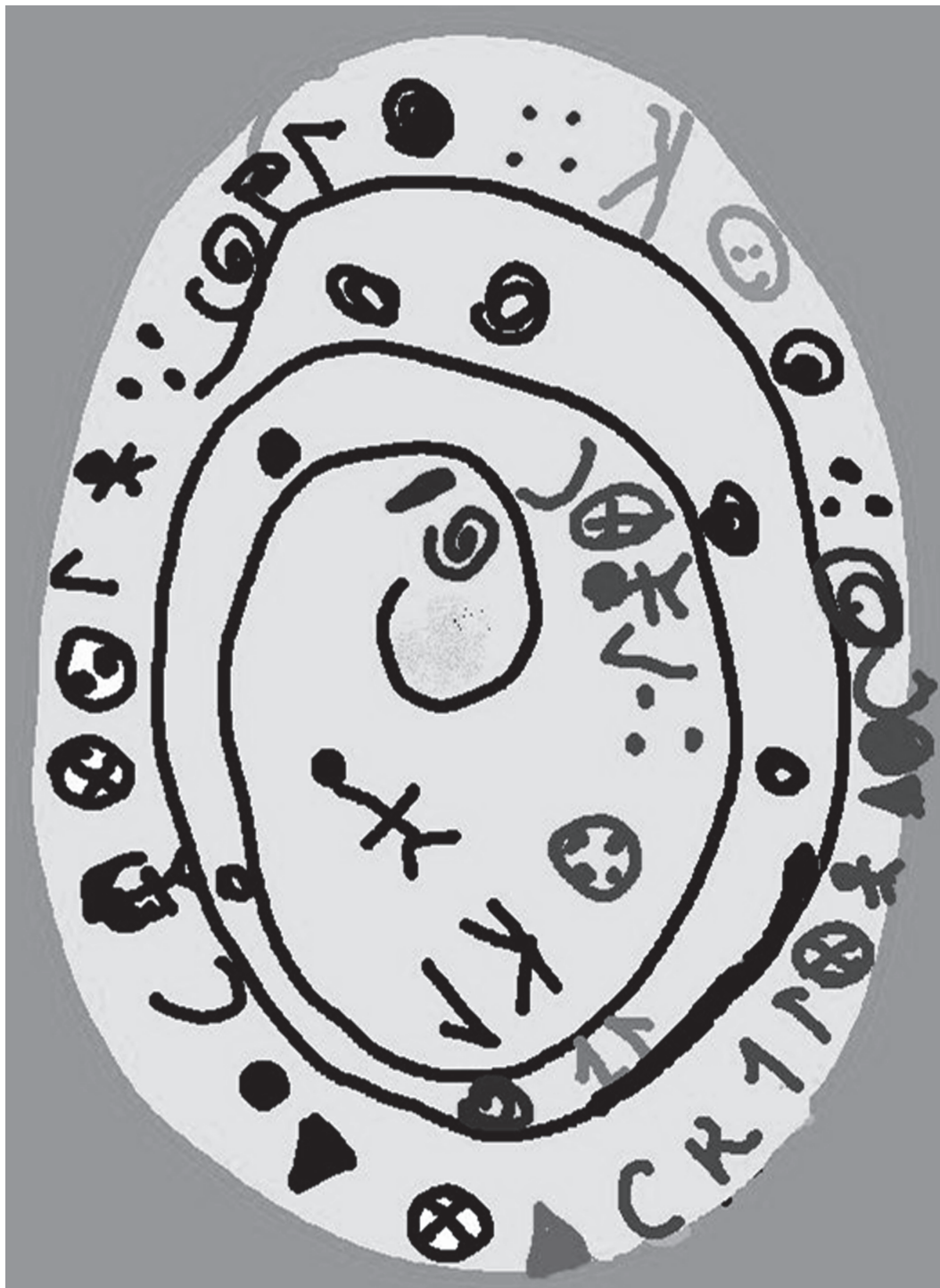
Figure 2. Students' drawing (2th grade): "Phaistos Disk", the first typography system in history