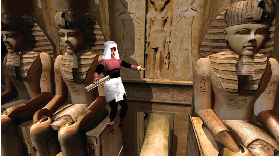
Figure 4. 3D VIE Ancient Egypt & avatar appearance in Second Life