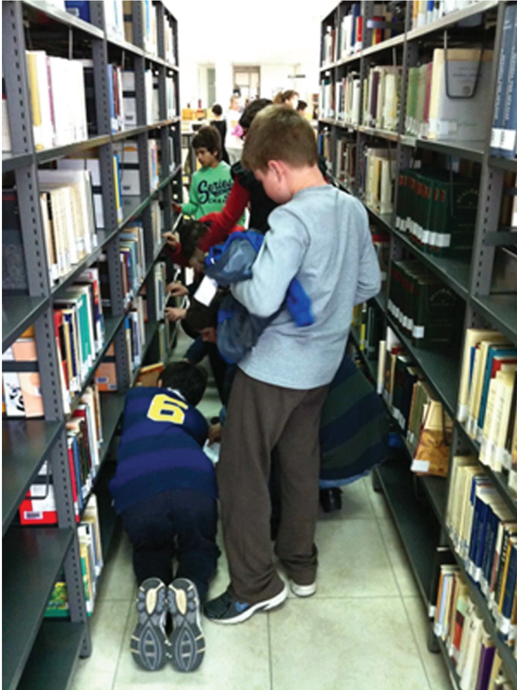
Figure 1. Playful Library Tour: Students searching for books