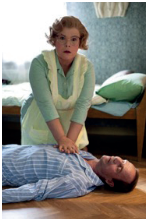
Figure 3. The hubots Vera and Lennart Engman.

more uncertain. Importantly, while Vera represents the prototype carer, Odi's male and young embodiment, combined with his not-quite functioning programming, links questions of unconventional care to masculinity, as well as to flawed training or unskilled work and young age. In light of this, Odi's capacities for care align with unskilled and temporary care work rather than sanctioned care. As such, Åtta människor challenges our existing affective imaginaries about "the carer" by questioning what kind of work "we" can trust to persons with low socioeconomic, class, gender and racial status. It also points to ongoing political debates about providing individualized care to people with minority backgrounds.