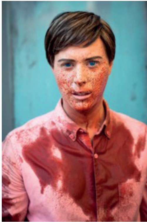
Figure 2. The hubot Odi .

Stubberud 2015). All of these positions are defined by their (intimate) labour for the white subject/family. As such, Anita/Mimi arguably represents a different form of care narrative from Odi: care as servitude .