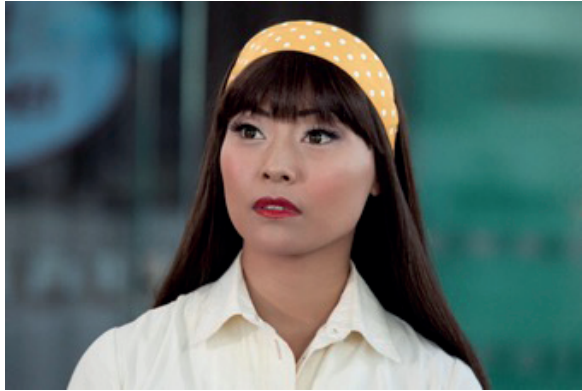
Figure 1. The hubot Anita/Mimi.