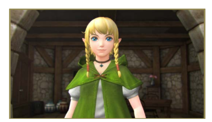
Figure 7. Screenshot of Linkle from Hyrule Warriors Legends (Omega Force & Team Ninja, 2015).

critical reaction to the announcement of Linkle was mixed. Jess Joho (2015), writing for KillScreen , articulated her frustration and disappointment at the reveal of Linkle: