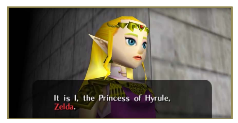
Figure 8. Screenshot after Sheik is revealed to be Princess Zelda in Ocarina of Time (Nintendo, 1998).