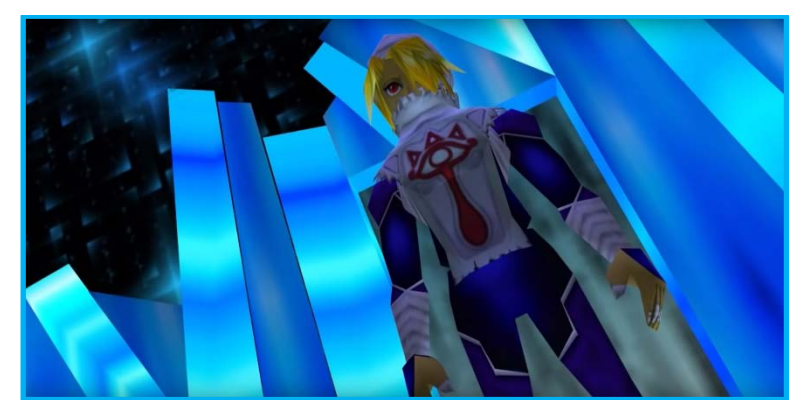
Figure 7. Princess Zelda disguised as Sheik in a screenshot from Ocarina of Time (Nintendo, 1998).

Almost immediately after the release of Ocarina of Time, fan debate heated up regarding Sheik's gender. While in disguise, Sheik has a very masculine appearance, is given male pronouns, and is referred to as a young man by Princess Ruto. Some fans argued that this meant Sheik really is physically male, and the noncanon manga adaptation of Ocarina of Time, released in 1998, confirmed this. In the manga , Zelda actually magically transformed herself into a biological male