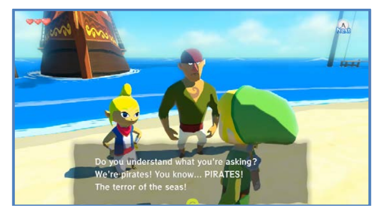
Figure 9. Tetra (left) is a confident, rambunctious pirate leader, shown in a screenshot from Wind Waker (Nintendo, 2002).

Tetra debuted in Wind Waker as a rambunctious, tomboyish pirate captain with tanned skin and blonde hair (see Figure 11). Although a child, she is the fearless leader of a gang of pirates who respect her and obey her orders. She grudgingly assists Link to rescue his sister, albeit for her own reasons, but in doing so, Ganondorf discovers her true identity as Princess Zelda. Tetra and Link flee to the ruins of Hyrule castle, where the king of Hyrule tells Tetra of the fate she was born into and she is physically transformed into Zelda. Her skin gets lighter, her hair gets longer, her pirate clothing becomes a pink dress, and she is wearing make-up and jewelry (see Figure 12). Unsurprisingly, Tetra seems horrified and saddened by her fate, particularly because the power and freedom she enjoyed as Tetra is taken from her. She is forced to remain hidden in the ruins instead of journeying alongside Link because, as the king says to her, "It is far too dangerous for you to