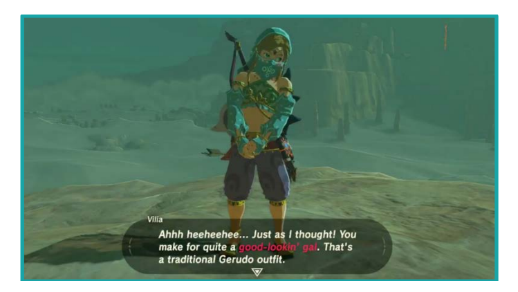
Figure 6. Link wearing female Gerudo clothing in a screenshot from Breath of the Wild (Nintendo, 2017).

Androgynous men, whose aesthetic I will call "masculine-skewed androgyny" in reference to Adams' (2018) work, have been popular in Japanese culture for centuries, perhaps influenced by the yarō-kabuki , or young man kabuki, theatrical traditions. Kabuki was a common form of entertainment in the 17th century, although female kabuki , called onna kabuki , was banned by the Tokugawa Shogunate in 1629 for being too erotic and because the performers were available for prostitution (Shively, 2002). After this ban, men and adolescent boys took over the female roles. These cross-dressing actors, called onnagata or oyama (female-role) were chosen for their beauty and higher-pitched voices; they were often presented in an erotic context and available for prostitution as well (Shively, 2002, p. 34–41).