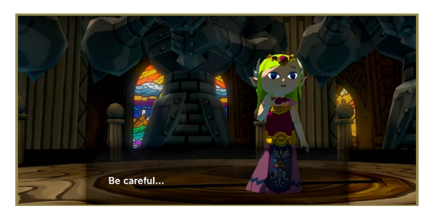
Figure 10. In this screenshot from Wind Waker (Nintendo, 2002), Tetra has been transformed into Princess Zelda, who sadly waves goodbye to Link and warns him to "Be careful" because she can no longer adventure alongside him.

join us in this task." She waves sadly at Link as he goes off to save the day after apologizing to him for being the source of his troubles. The brave and adventurous Tetra is completely gone, replaced by a sad, apologetic, helpless, and distinctly more feminine princess. Zelda is captured later by Ganondorf and rendered unconscious, for which she apologizes, saying she "overslept." During the final battle, Zelda helps Link fight Ganondorf with arrows of light that she shoots from her bow; of course, it is Link who strikes the final blow.