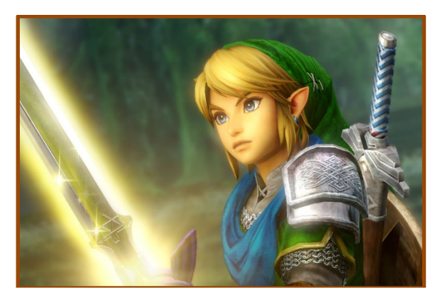
Figure 5. Screenshot of Link from Hyrule Warriors (Omega Force & Team Ninja, 2014).