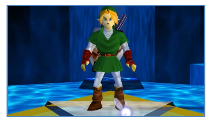
Figure 1. Screenshot of Link as an adult from Ocarina of Time (Nintendo, 1998).

his slim waist. Although the graphical capabilities and art style changed for each game, Link's highly recognizable design remained mostly consistent until Breath of the Wild.