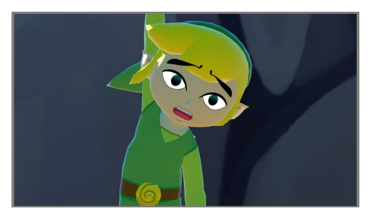
Figure 2. In this screenshot from Wind Waker (Nintendo, 2002), Link is depicted in a more cartoonish way.