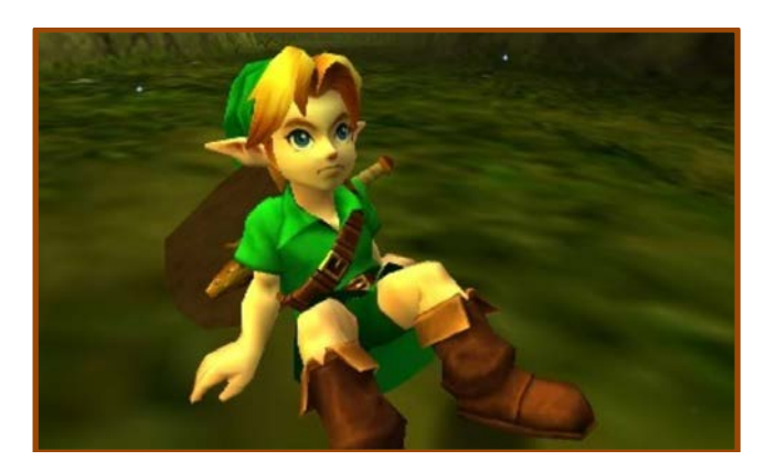
Figure 3. Child Link screenshot from the 3DS port of Ocarina of Time (Nintendo, 2011).

Figure 2. In this screenshot from Wind Waker (Nintendo, 2002), Link is depicted in a more cartoonish way.