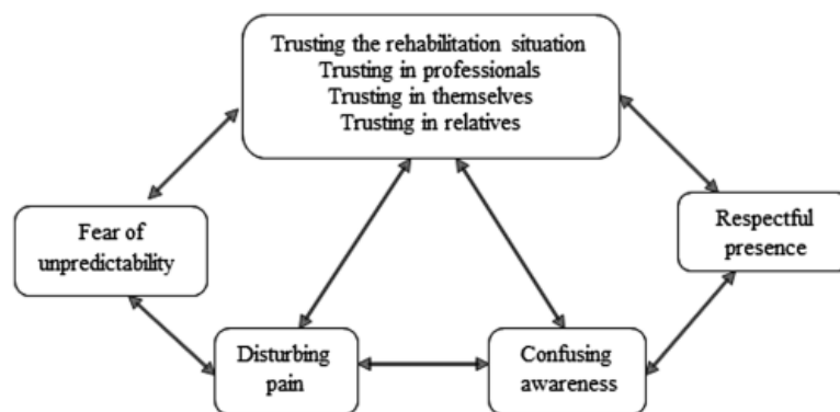
Figure 2. The structure of "meaning perspective of goal setting."

In this study, the goal attainment scale method was used in goal setting and each rehabilitee set one goal with the multidisciplinary team for the six-month rehabilitation period [4]. The meanings of the participation in the goal setting situation experienced by the rehabilitee were as follows: "trusting the rehabilitation situation" linked with the meanings "trusting professionals, oneself, and relatives," "respectful presence," "confusing awareness," "disturbing pain," and "fear of unpredictability." The most significant meaning "trusting the rehabilitation situation" included the meanings "trusting professionals" and "trusting oneself," and "trusting relatives" as seen in Figure 2. Above is the perspective from which the goal setting meaning perspective opens up and should be read (Figure 2). All meanings were connected to each other, forming interconnected triangles. The most valuable meaning "respectful presence" on the right proved to be the most significant of the rehabilitee's meaning units. The value of meanings was determined from each rehabilitee's individual meaning units and the synthesis of all rehabilitees meaning perspectives.