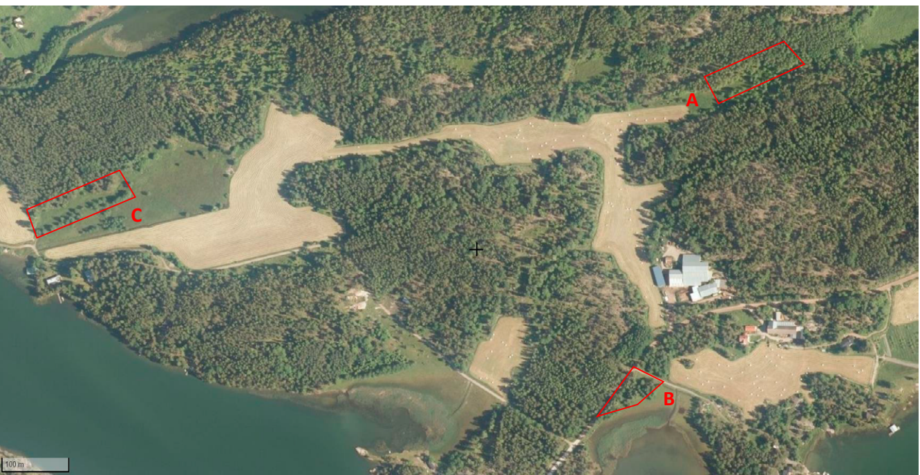
Figure 2. Aerial photograph of the study area, indicating the location of the studied pastures (A, B and C) within it.

Pasture C (1.3 ha) is constituted by a narrow, relatively open wood-pasture edge with mixed trees (dominated by Pinus sylvestris , Betula spp. and Picea abies ) (Fig. 3). It is bordered from one side by a meadow and from the other side by a recently selectively logged pine-dominated wood-pasture. This pasture has aesthetic landscape values and it hosts many red-listed vascular plant species. The mixed-tree wood-pasture edge is of herb-rich heath forest. Dominant vascular plant