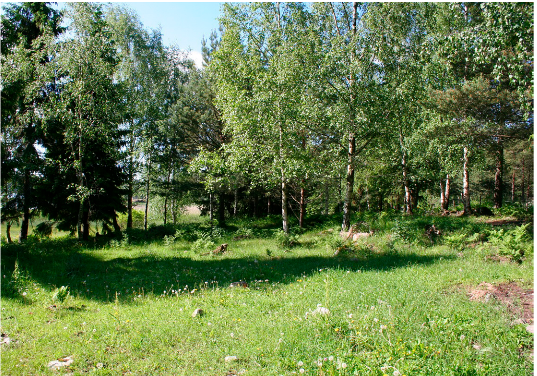
Figure 3. Study pasture B.