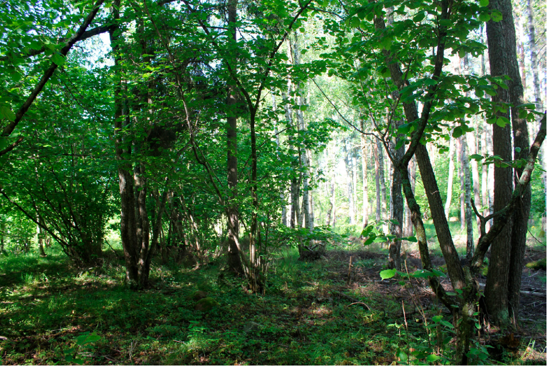
Figure 3. The main habitat types of each study pasture. Study pasture A, photo by Kaisa Tervonen.