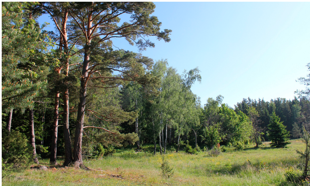
Figure 3. Study pasture C.

species were Rumex acetosa , Lathyrus pratensis , Poa pratensis and Pimpinella saxifraga . Bryophyte Rhytidiadelphus squarrosus dominated in the semi-open edge while Pleurozium schreberi dominated higher up in the spruce-dominated wood-pasture. The plot area also includes patches of bare cliff (dominated by Dicranum scoparium ) and some moist herb-rich patches in the shallow depressions ( Brachythecium rutabulum , Climacium dendroides and Plagiomnium spp.).